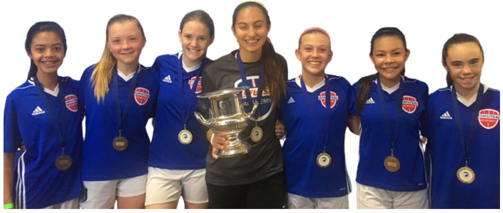
2019 USFF U14 Regional Tournament Champions

The 619Futsal Academy have had team and individual successes since our inception. Here is a recap of the honors the 619Futsal Academy received in the past years.