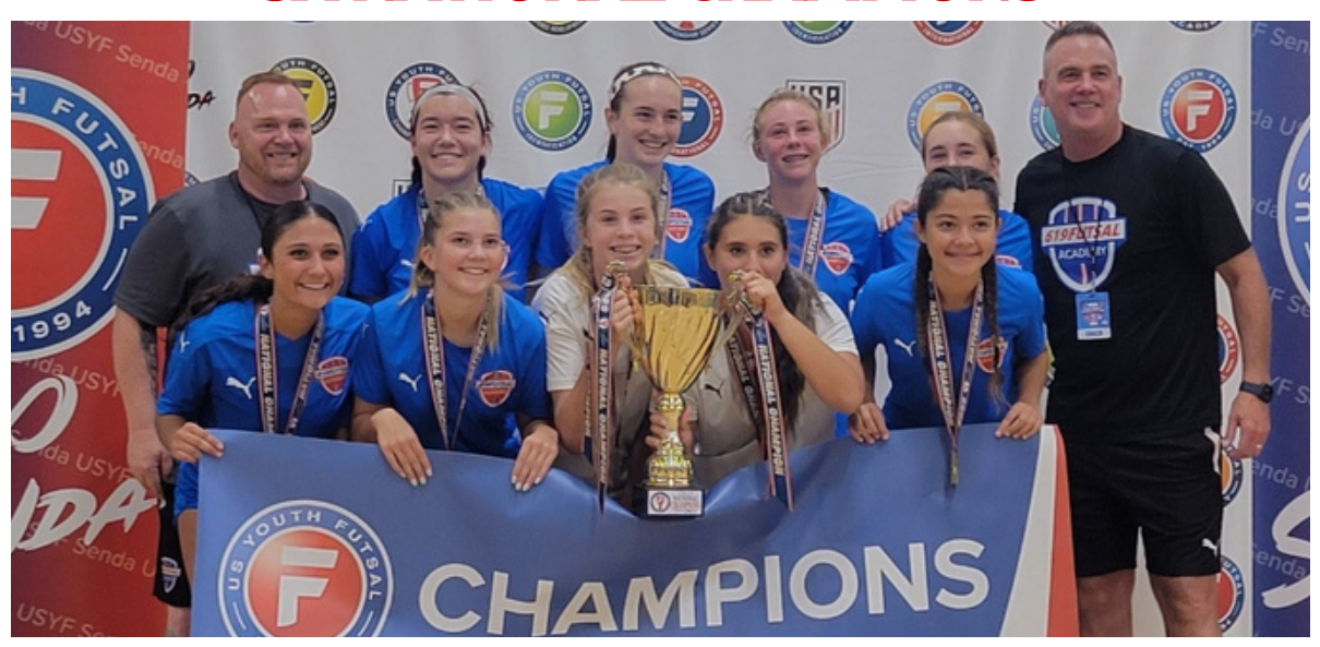
2023 USYF Girls 2006 National Champions