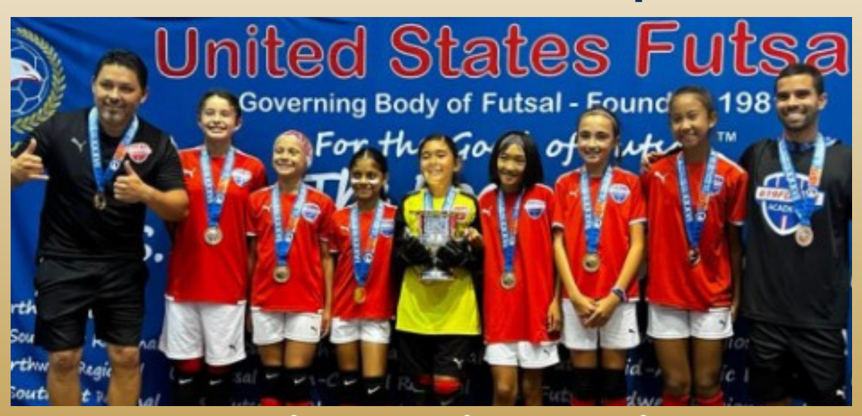
2022 USF Girls 2011 National Champions