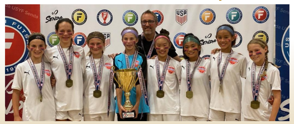
2022 USYF Girls 2010 National Champions