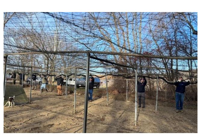
Above: Members help roll up the pheasant pen netting. Thanks for your help!