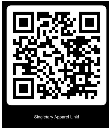
Singletary Apparel Link!