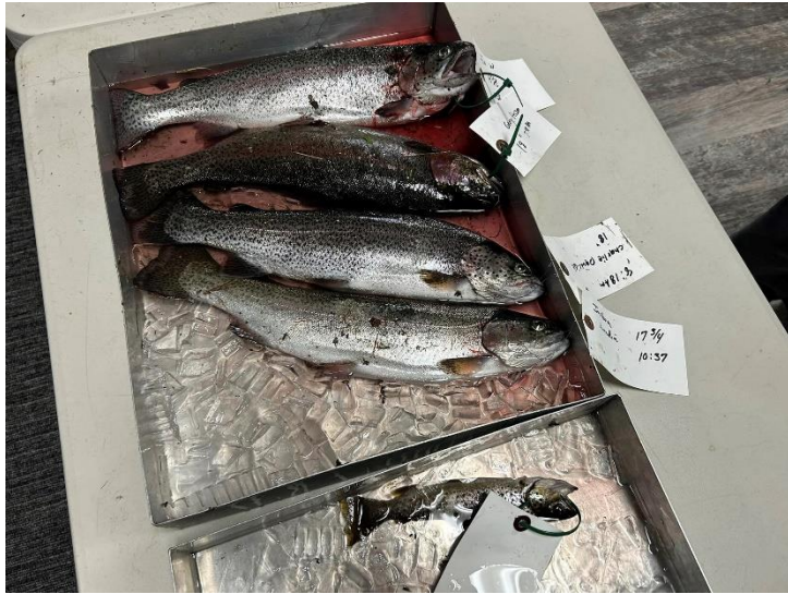
Above: Winning fish at the 2024 Spring Fishing Derby! Congrats to all the winners!