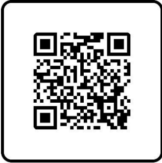
Members Only Facebook Page!