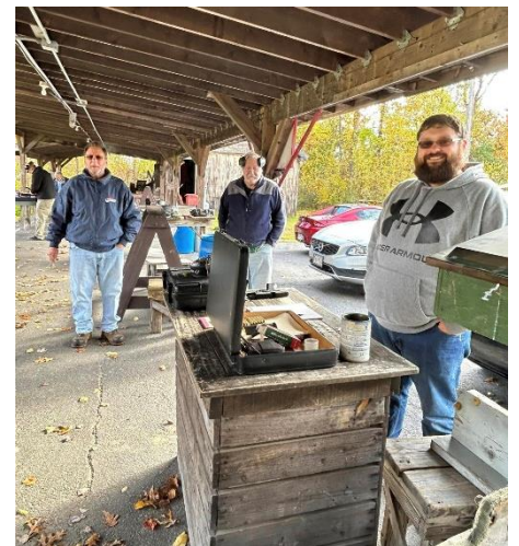
Shooters at the October 22 nd pistol shoot