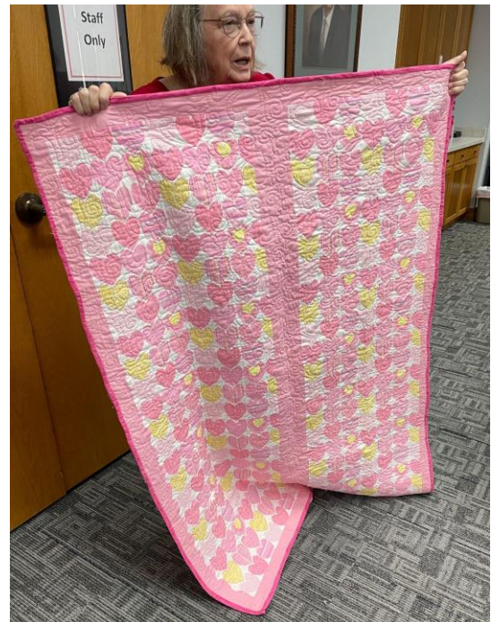
Pink Blonding Heart Quilt for a Friend (Back)