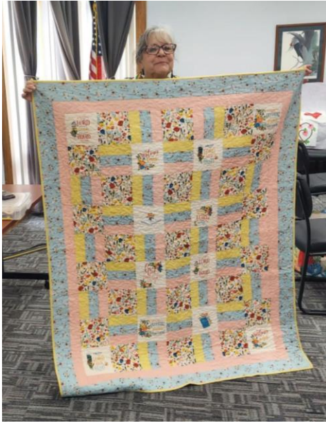
Hugs & Prayers For a Friend's Grandson