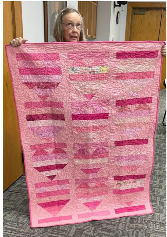
Pink Blonding Heart Quilt for a Friend (Front)