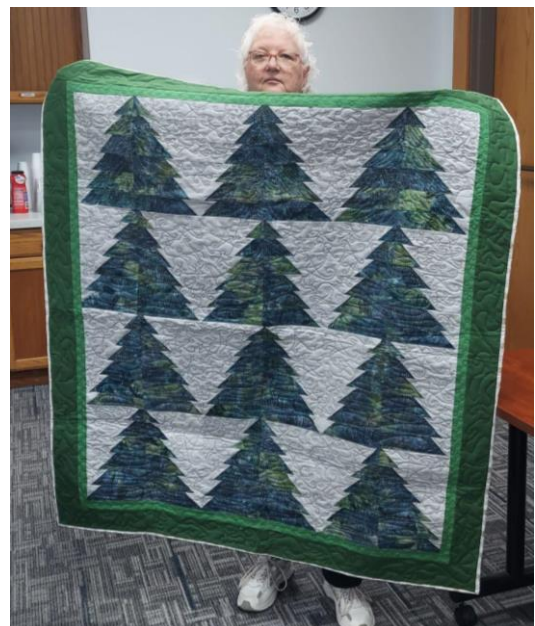
My Silver Trees