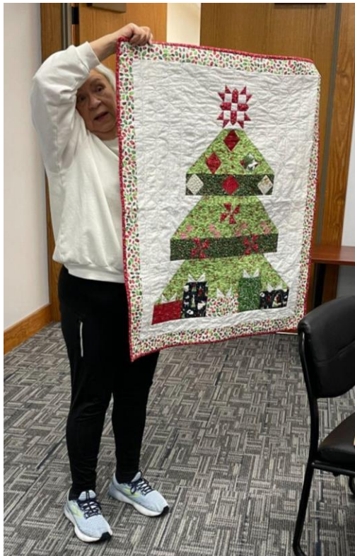
July Mystery Quilt