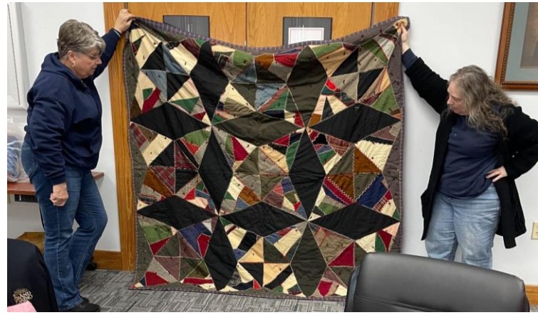
Wool Crazy Quilt circa 1880's