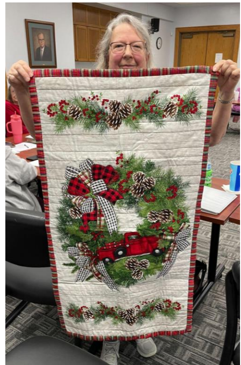
Red Truck Christmas Panel Quilt