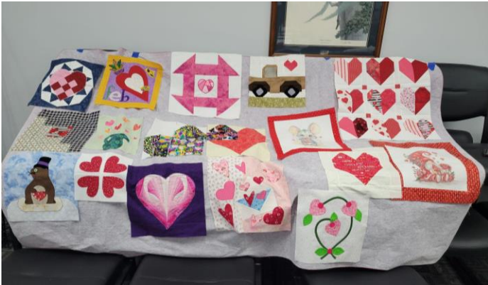
February Calendar Blocks

Many members brought in their February Calendar Blocks. Many different ideas!