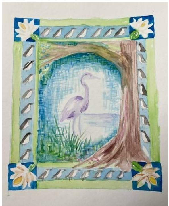
2025 Opportunity Quilt Design