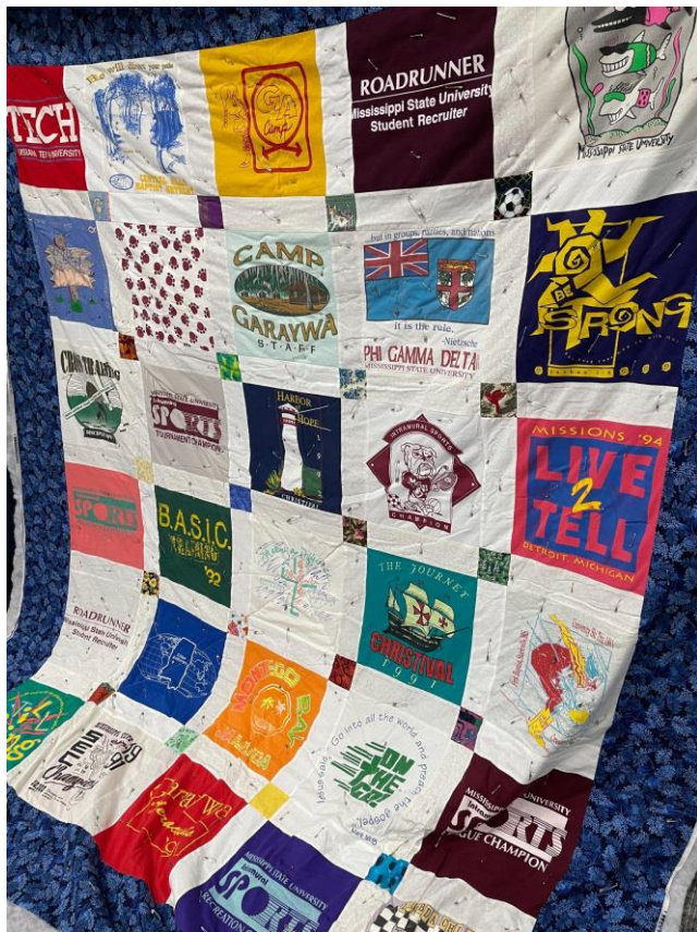
University Quilt for Donation