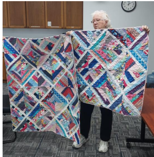
Quilts for 2 Granddaughters