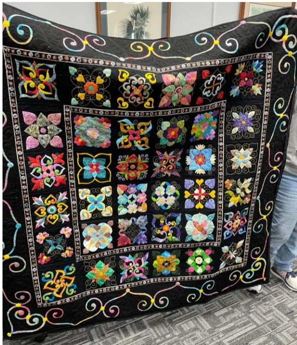
Affairs of the Heart (Started 2007) Hand Embroidered