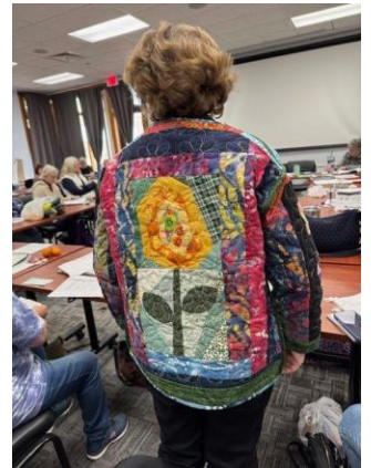
Quilted Jacket Redone & Reversible