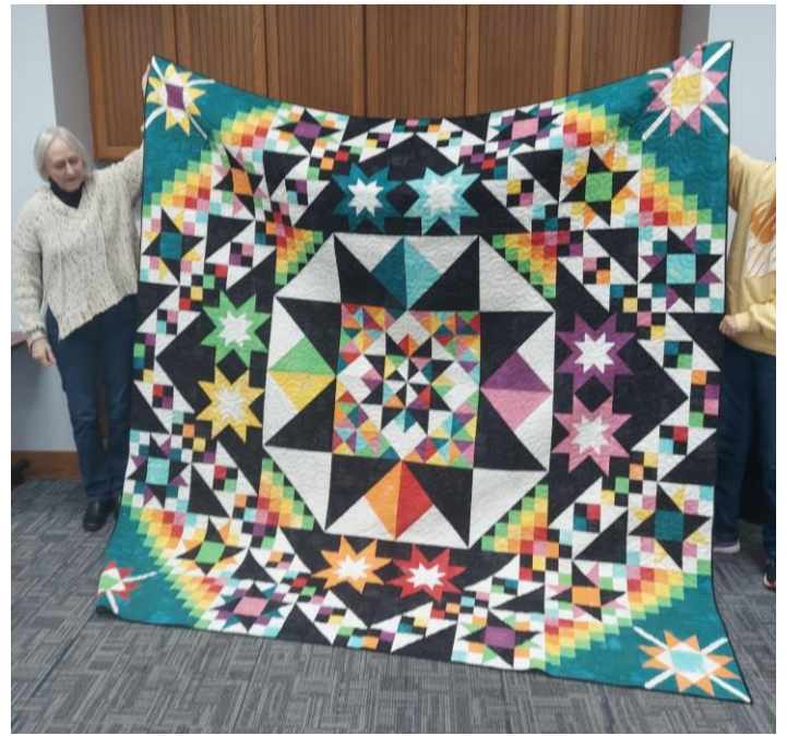
Fabulous - Block of the Month