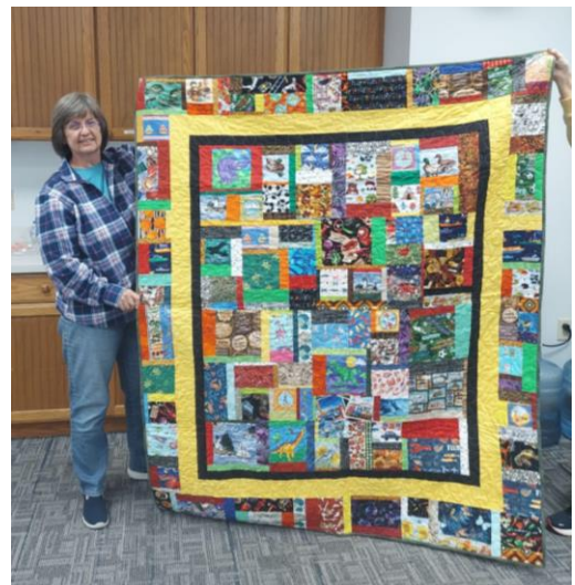
The Quilter's Version of I Spy