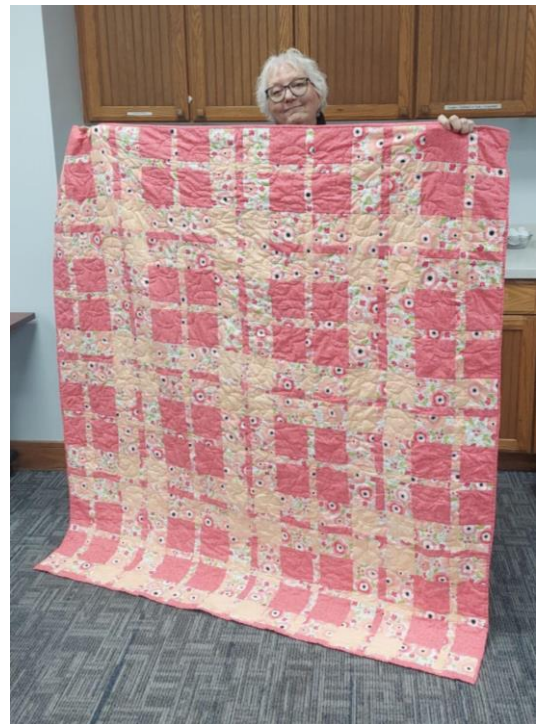
Pink Plaid Free Pattern