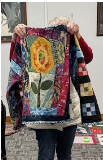
Quilted Jacket - UFO Project - Dec. 2024 Then Became a Dirty Santa Present