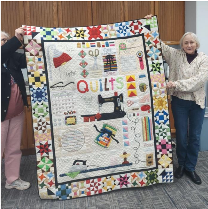
Quilts - Laurie Holt Pattern