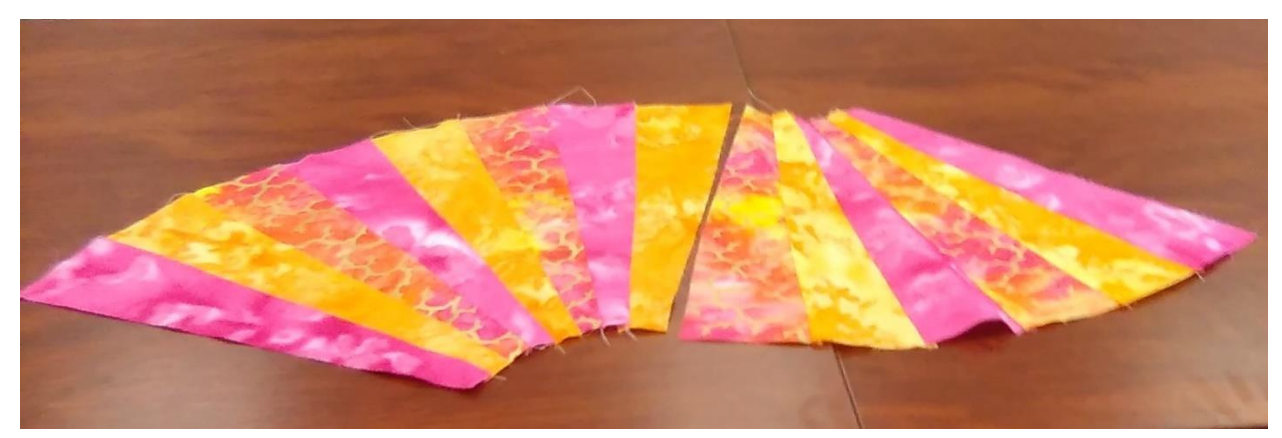
8 Piece and 6 Piece Sections

You can alternate the 8 piece and 6 piece sections as shown or use all 6 piece sections or all 8 piece sections to form the curved table runner.