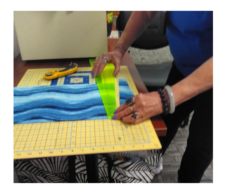
Flip the ruler and cut the third piece.

Flip the ruler and cut the second piece.