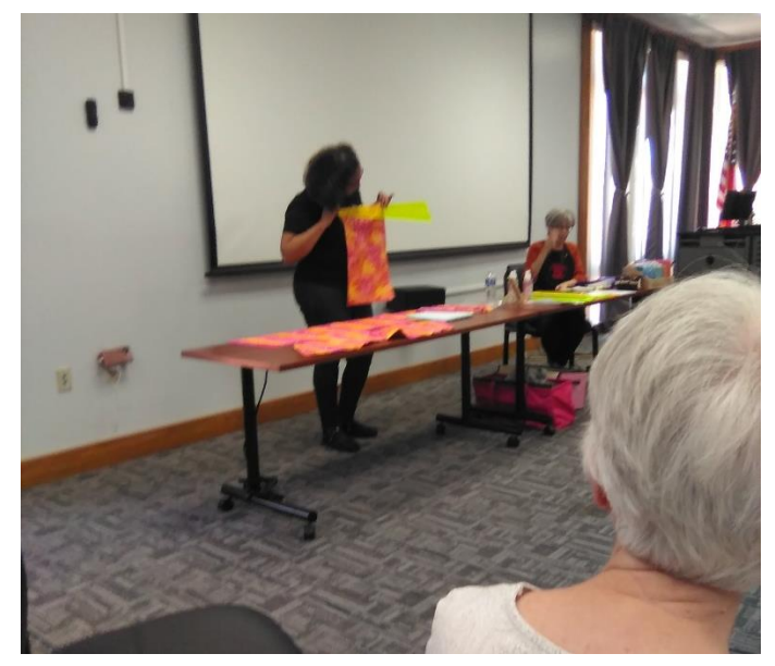
Demonstrating How to Use the Ruler

Line up the top of the ruler to the top of the fabric as close to the edge as possible. The first cut of the fabric is waste because of the ruler's slant.