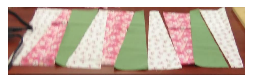
Curved pattern in progress. Sections can be 6 or 8 pieces.