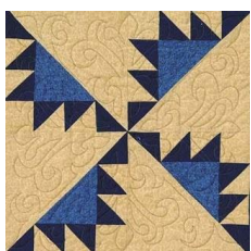
5 Kansas Troubles