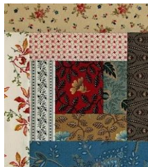
7 Log Cabin