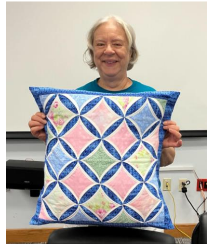
Cathedral Window Pillow