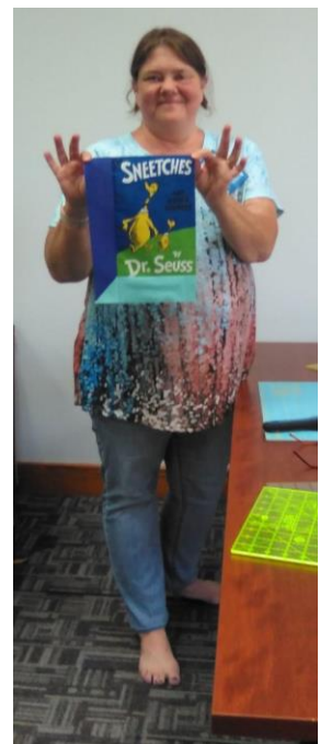
Individual Panel Into a Finished Attic Block