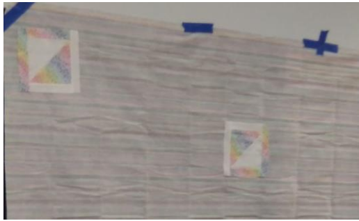
Which Way Do the Blocks Go?

There were errors in placing finished squares and other errors along the way. All is calm, all is fixed.