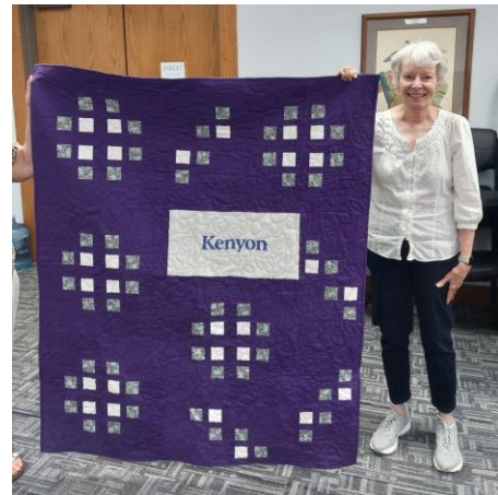
Kenyon College Quilt for Granddaughter