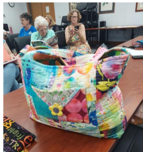
Had My Dirty Santa Present Stolen So I Made My Own!