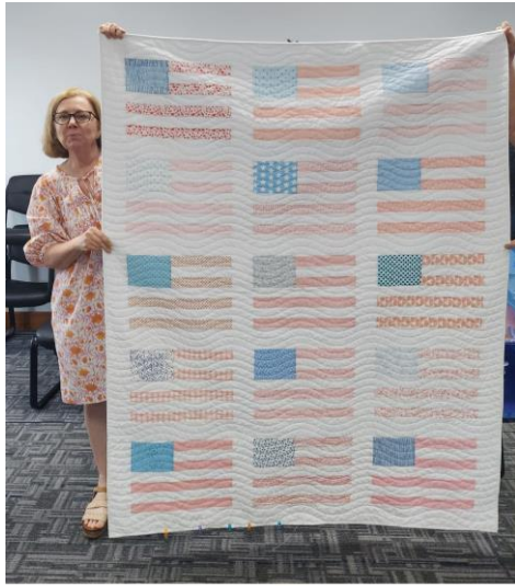
American Flags in Muted Colors