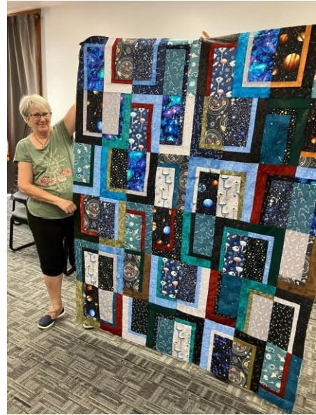
The Cosmos for Grandson