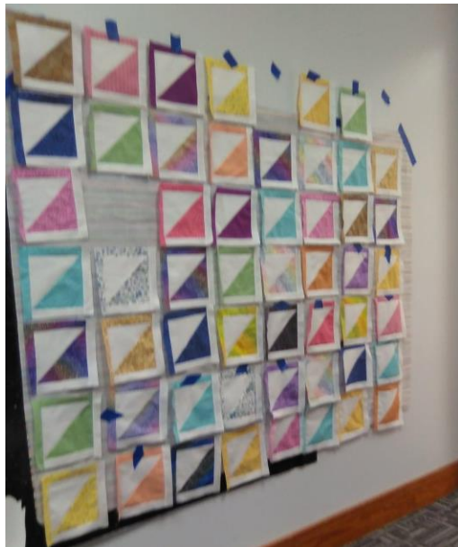
Can You Find the Error?