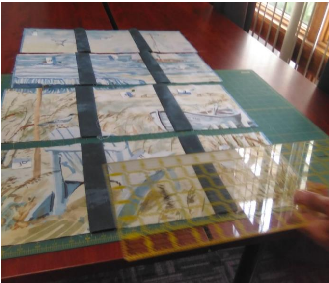
Measuring For Full Picture Alignment

Missouri Star has a video on the Attic Quilt: https://www.youtube.com/watch?v=H-vzIOJp3ak