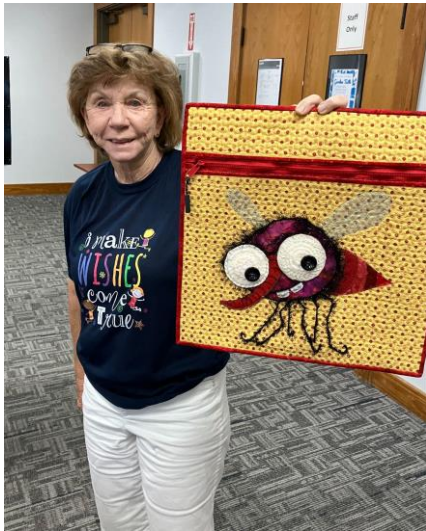
Project Bag with a Mosquito And Felt Circle Eyes