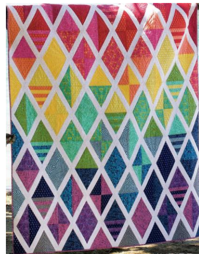
Set Sail by Jaybird Quilts