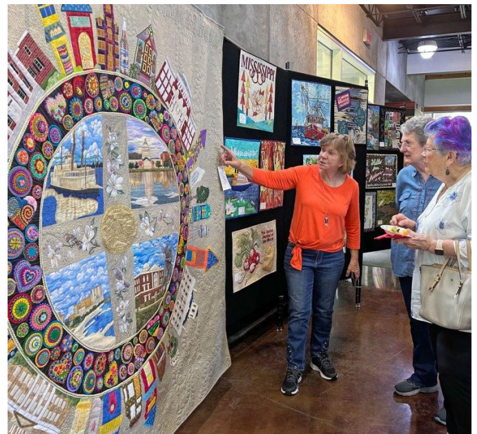
Fiber Artists Show