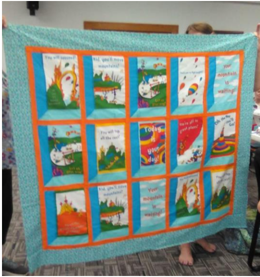
Completed Dr. Seuss Book Covers Quilt Top