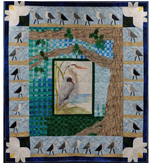
Coastal Reflections - Finished!