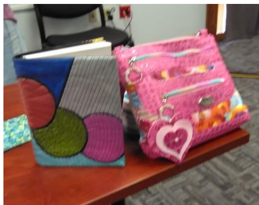
Book Cover and Purse