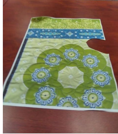
Two Fabric Sheets To Be Used For Repairs

In order to repair a tear, a piece of the same fabric pattern must be inserted through the hole and laid flat under the top fabric.