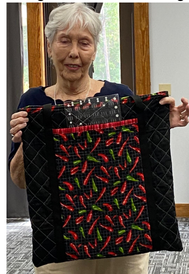
Gloria Burlette Quilted Tote Bag Project