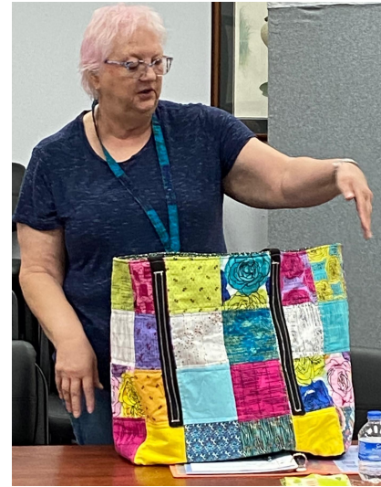
April Holifield Charm pack Tote