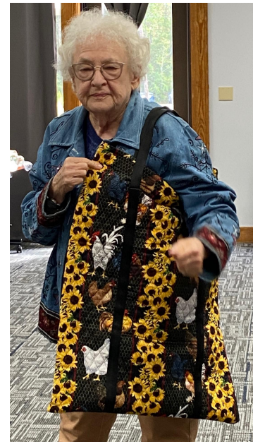
Judy Flanagan Quilted Tote Bag Project