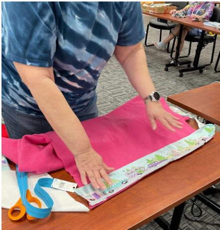
Adding Length to Jacket Body