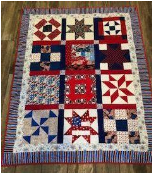
GSQA Blocks Veteran Donation Quilt #4