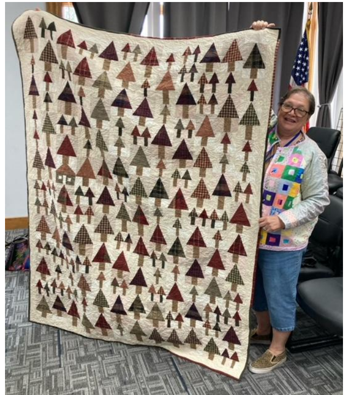
Little House in the Woods