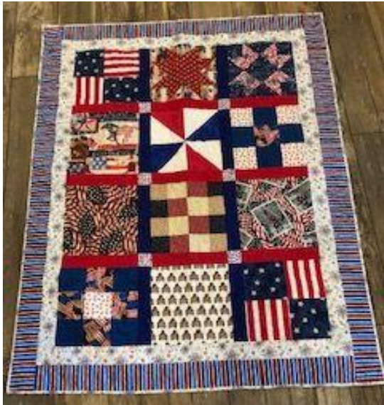
GSQA Blocks Veteran Donation Quilt #3