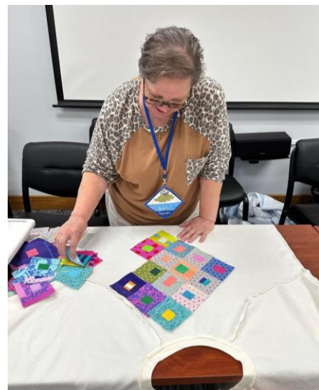
Focal Point Layout Design