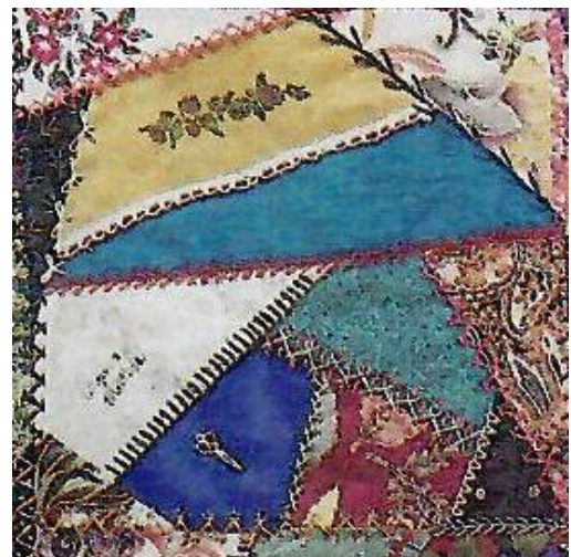
Crazy Quilt Block for November