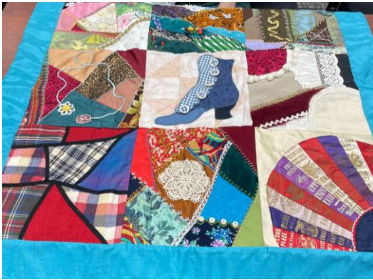
Victorian Crazy Quilt Example