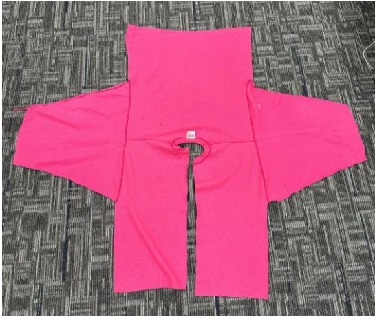
Side Seams Cut and Front Panel Cut for Zipper