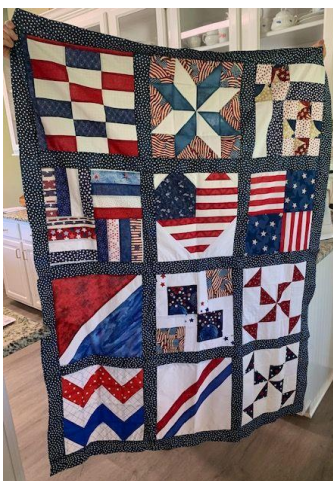
Completed Veteran Donation Quilt Top #2