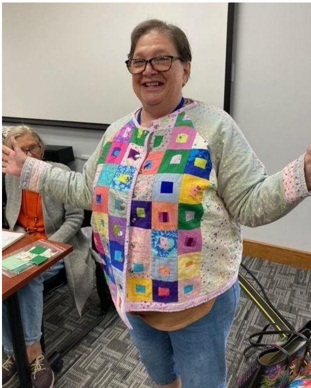
Sweatshirt Jacket - October Program Meeting Project