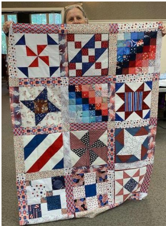
Completed Veteran Donation Quilt Top #1