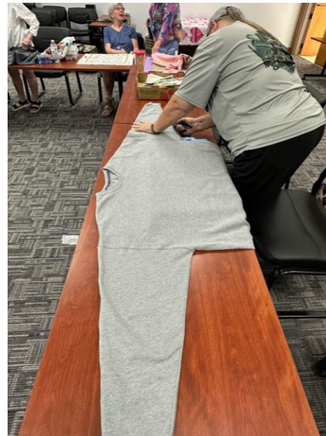
Cutting Side Seams

April led members through the steps to make the jacket.