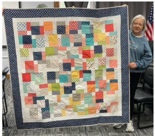
Disappearing 9 Patch