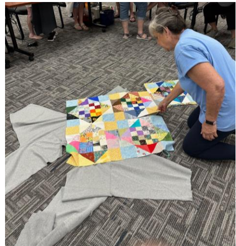
Design Layout - Need Room