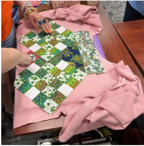
Random Layout Design