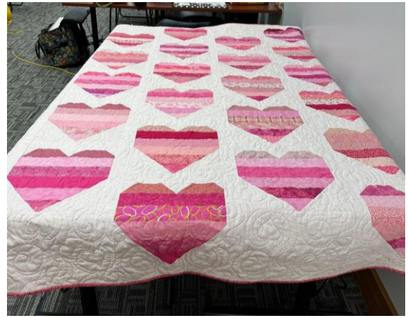
Completed Pink Heart Charity Quilt