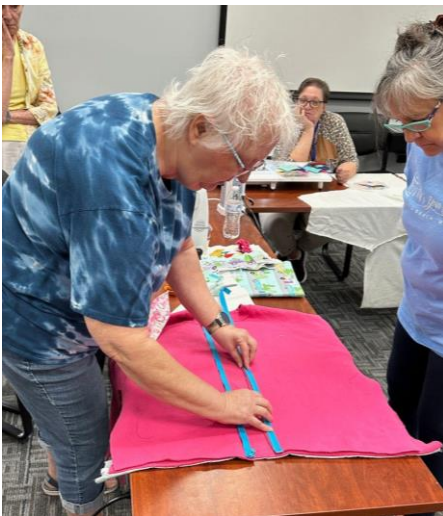
Laying Out the Zipper