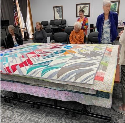
October Program - Discussion on Quilt Show Critiques, we learned a lot on what the judges look for in quilts entered into a show.