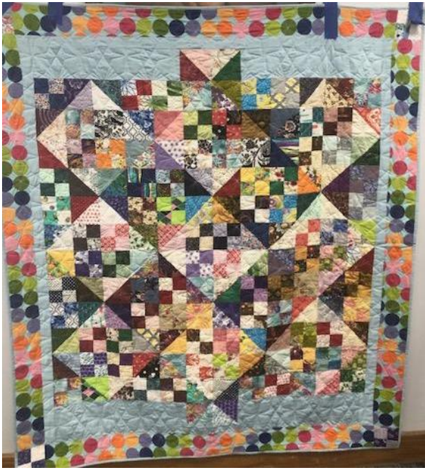
Design #2 for HST and 4 Patch - Light and Dark