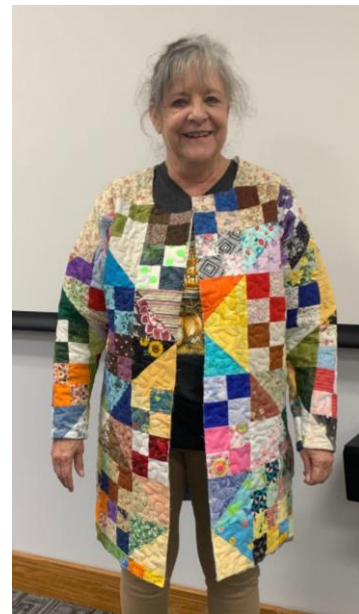
Sweatshirt Jacket Front