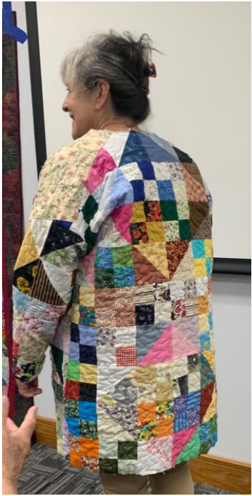
Sweatshirt Jacket Back