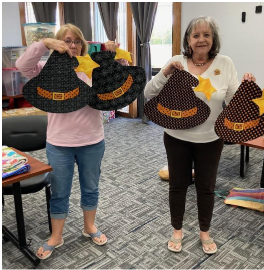
Halloween Placemats Future Program Meeting Project