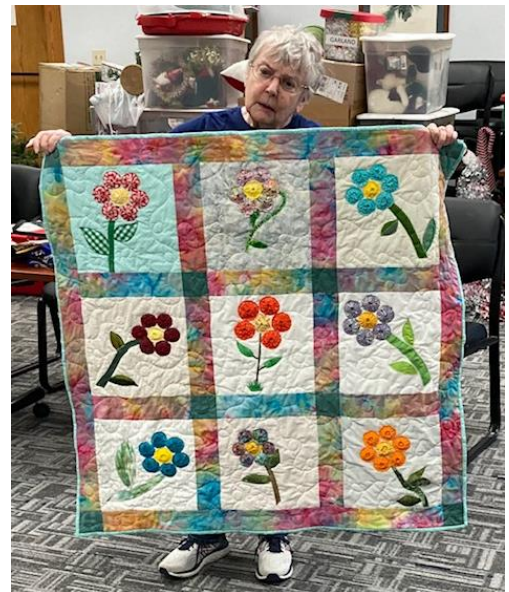
Pom Poms - Charity Quilt