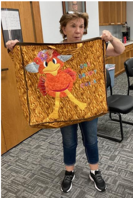
Sassy Bird Bag