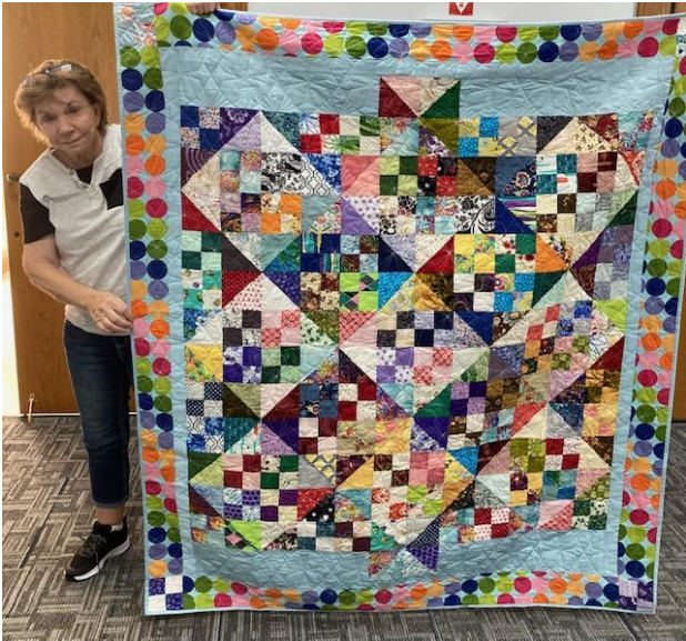
4 Patch & HST Monthly Exchange and Owls October 2023 Program Meeting - Designs Front