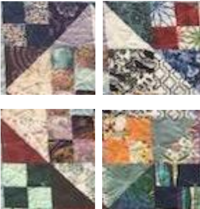
The Dark Colors to the Outside