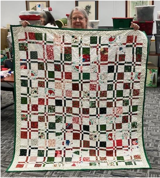
Christmas Presents Disappearing 4 Patch September 2022 Sew & Draw