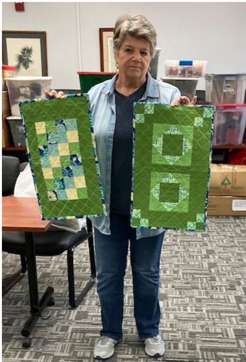
Placemats Wonky/Pineapple Block June 2023 Program Meeting