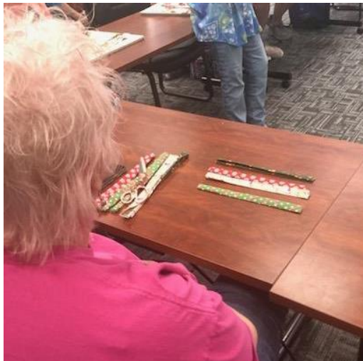
Strips Pressed in Half After Pressed to Center