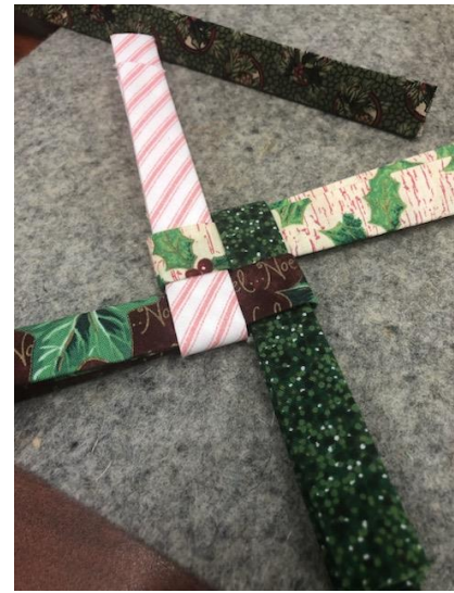
Center of Star Ornament