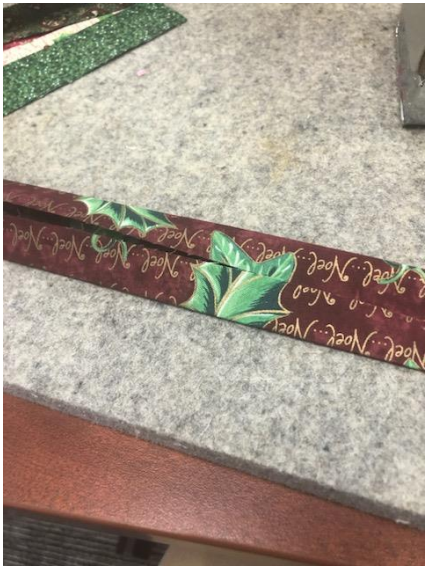
Seams Pressed to Center