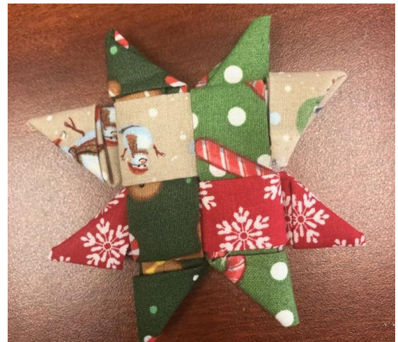
Finished Star - April H.