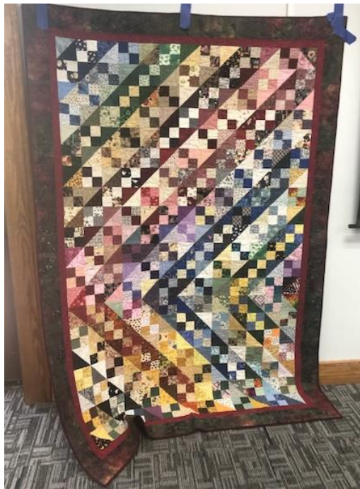
Design #1 for HST and 4 Patch - Jacob's Ladder