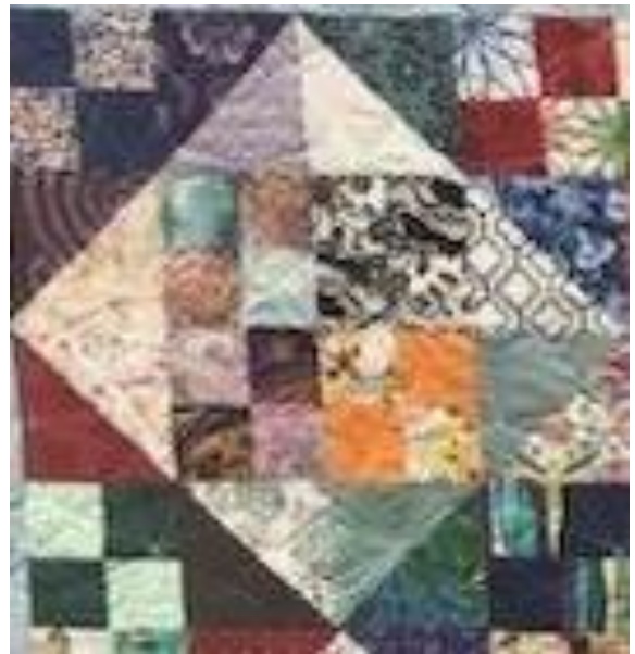
The Dark Colors to the Outside Together