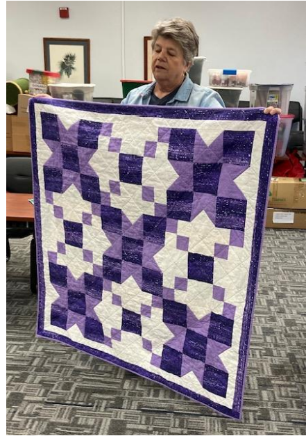
Purple 3 Yard Quilt