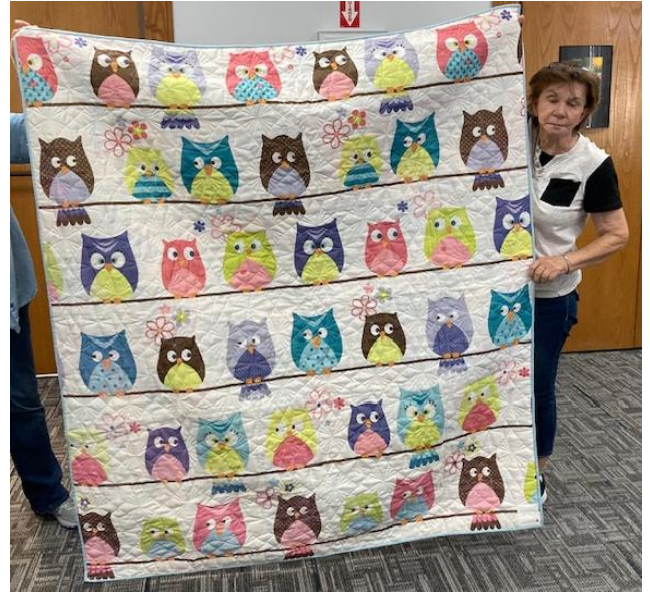
4 Patch & HST Monthly Exchange and Owls October 2023 Program Meeting - Designs Back