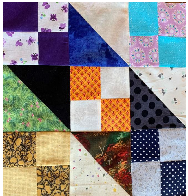
Jacob's Ladder Pattern