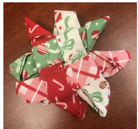
Finished Star - I Tried