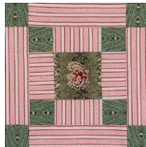
27 Irish Chain