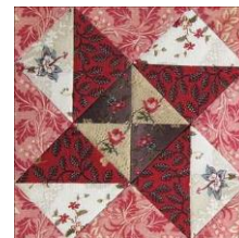
28 Next Door Neighbor