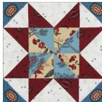
26 Barbara Fritchie Star