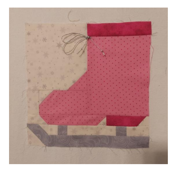
January Calendar Block - Ida M