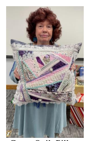
Crazy Quilt Pillow