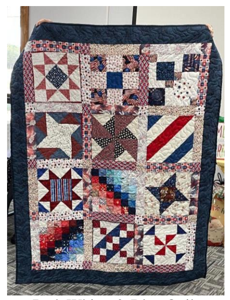
Red, White, & Blue Quilt