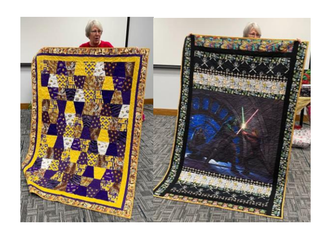
LSU/Star Wars Quilt