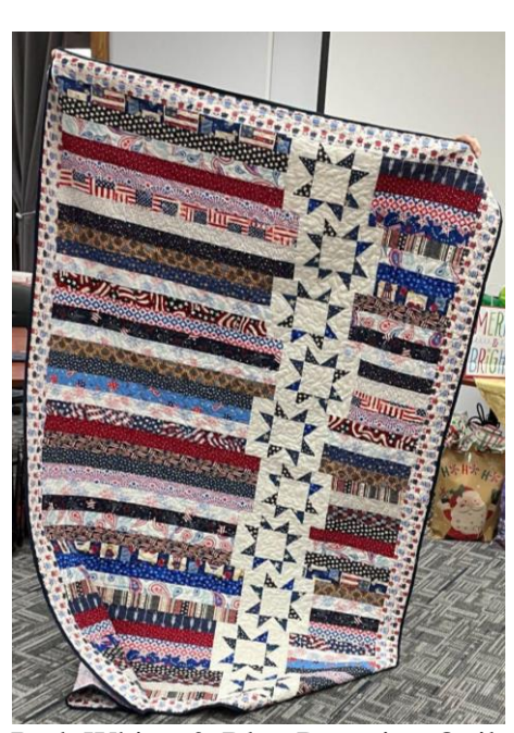
Red, White, & Blue Donation Quilt Women Veterans