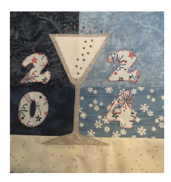
January Calendar Block - Sharon B

Example Blocks for Calendar Quilt for January 11, 2024, Business Meeting: