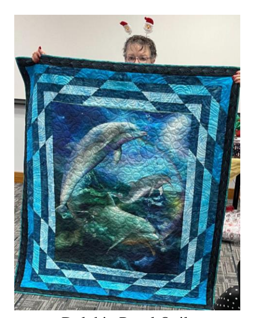
Dolphin Panel Quilt