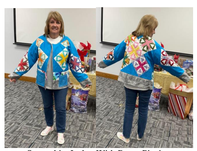
Sweatshirt Jacket With Paper Piecing