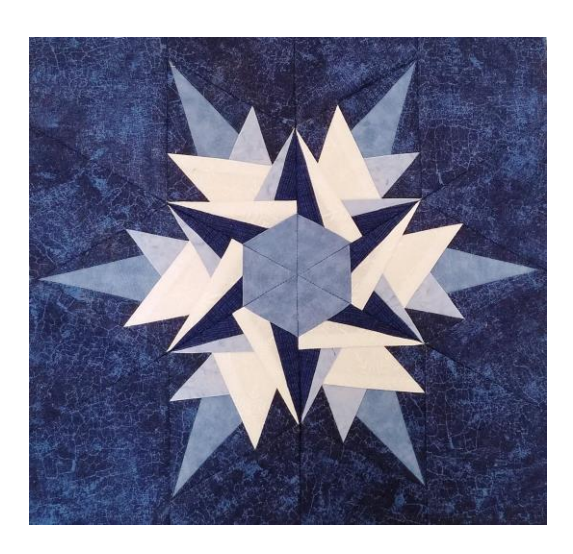
January Calendar Block - Kay G