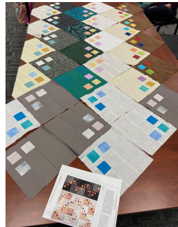
Corner Squared Design #3 Corner Squared Design #4