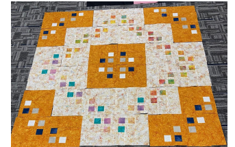
Corner Squared Design #5 Corner Squared Design #6