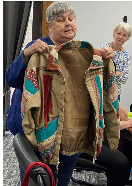
Mother's Handmade Jacket