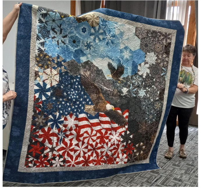
Eagles Quilt of Valor