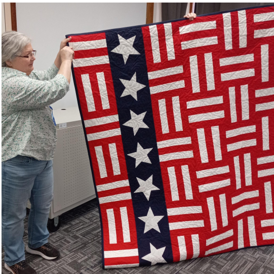
Stars and Stripes