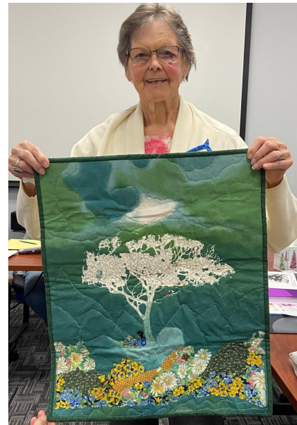
Tree in Flower Wall Hanging