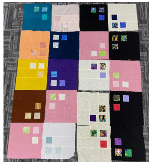
Corner Squared Design #1 Corner Squared Design #2