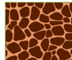
1/4 yard for cuff