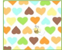
1/4 yard for cuff