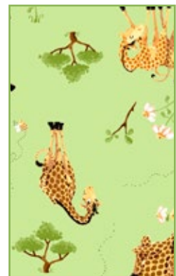
3/4 yd for pillowcase body