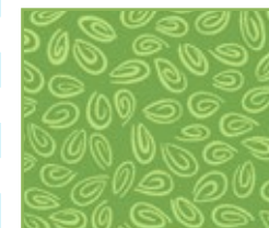
2" for flange