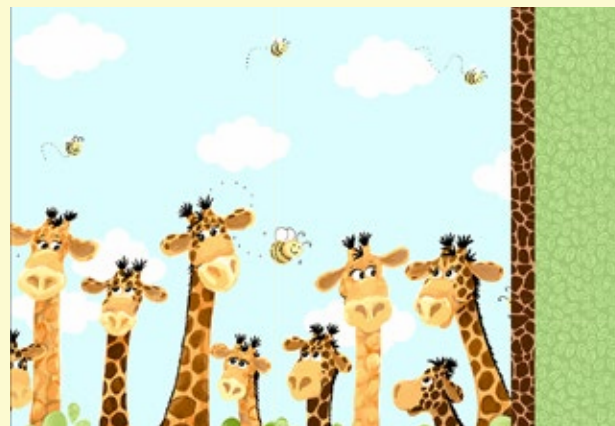
Standard Size Pillowcase

Includes complete instructions and link to a detailed video tutorial.