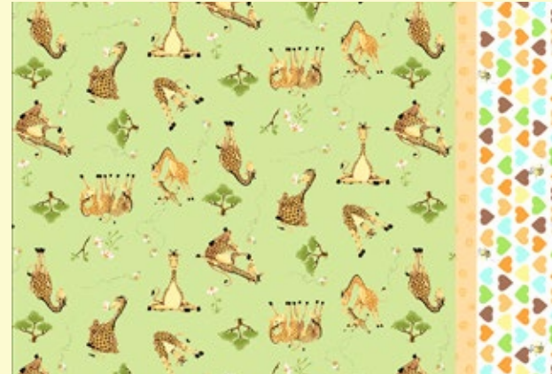
Standard Size Pillowcase

Includes complete instructions and link to a detailed video tutorial.