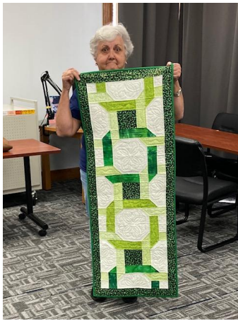
Celtic Table Runner