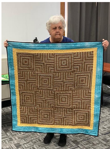
Stripes ALS Quilt