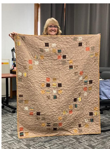
Corner Squared Block