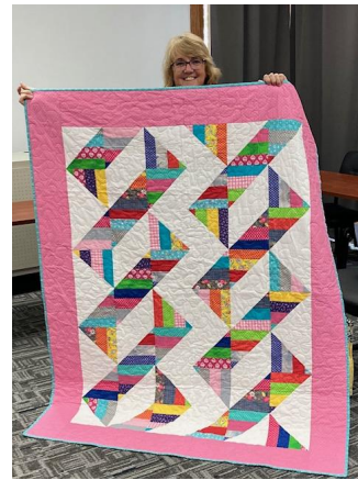
Twist & Turn Animal Shelter