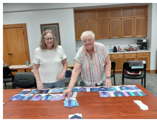
Placing Strips in Design