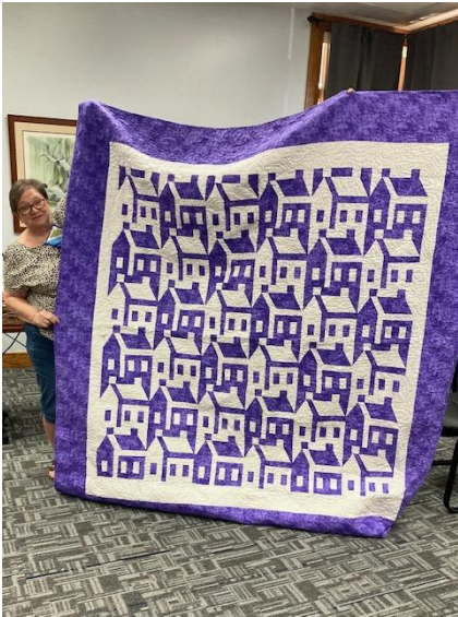
Habitat for Humanity Quilt