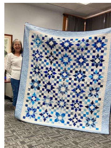
Winter Blue Quilt