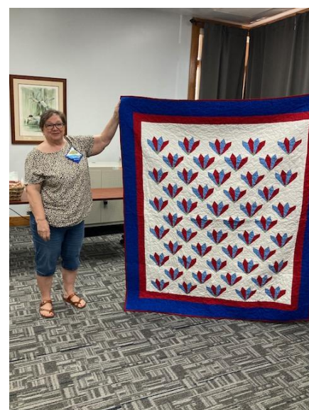
Dresden Veteran's Red, White, & Blue Quilt