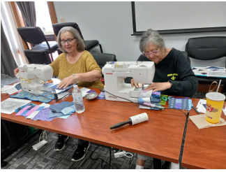
Sewing Blocks in Strips