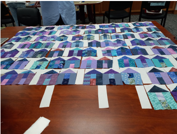
Quilt Top in Progress