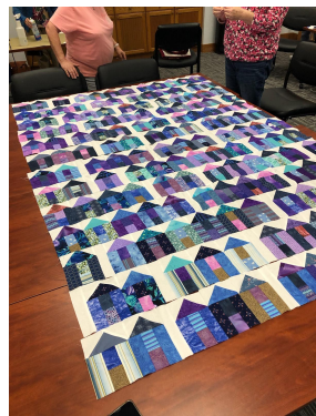
Finished Quilt Top