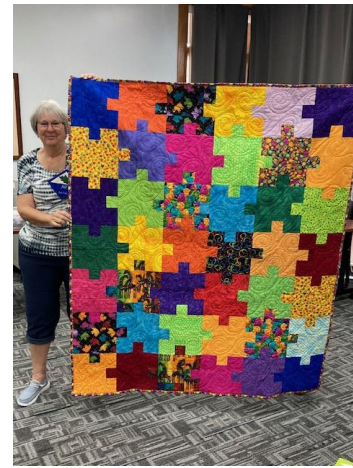
The Puzzle Quilt