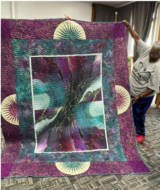
Unnamed Quilt With Fan Quilting