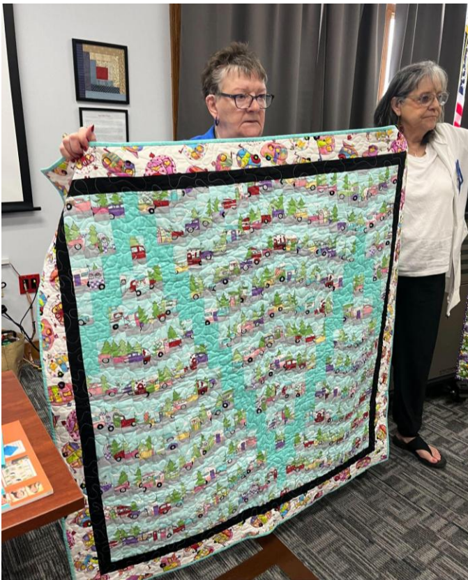
Fauxello Quilt Example