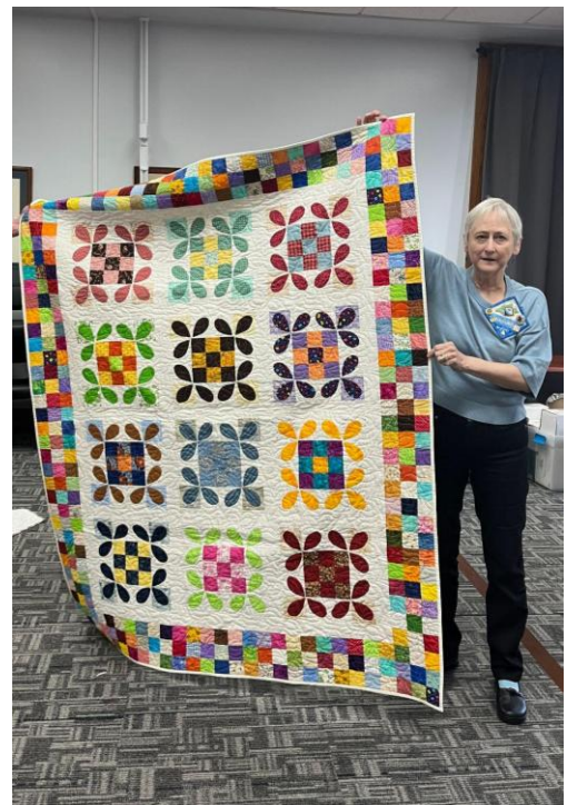
Honey Bee Quilt