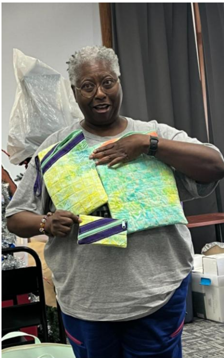
Diagonal Zipper Bag Collection