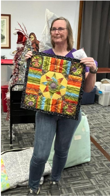
GSQA Challenge - 20 inch Square Block