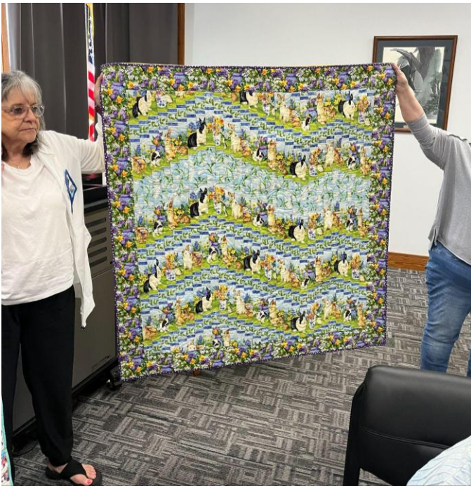
Fauxello Quilt Example