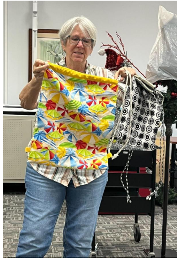
Donation Backpacks for Children