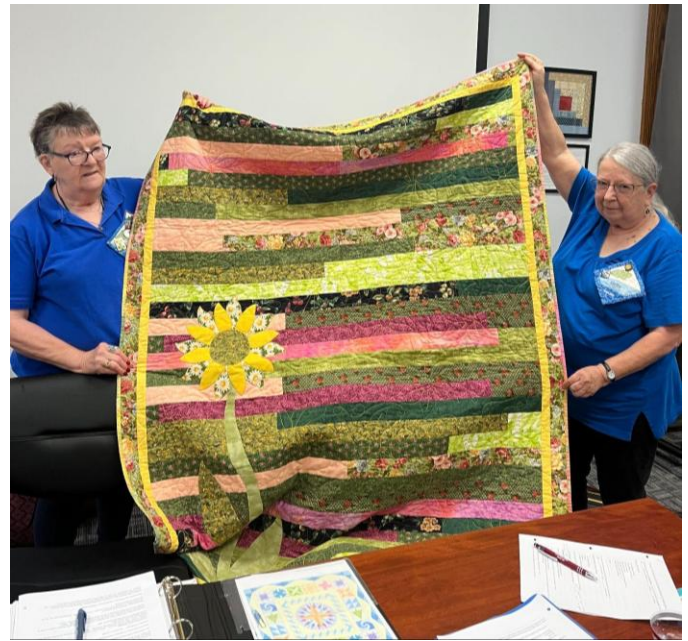
Strip Quilt Example