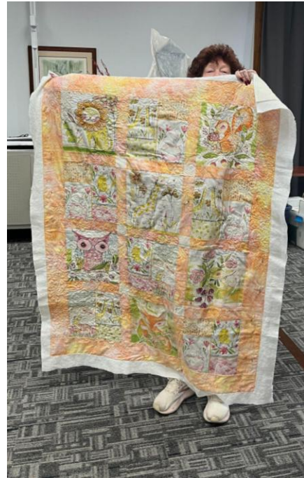
Baby Quilt in Progress