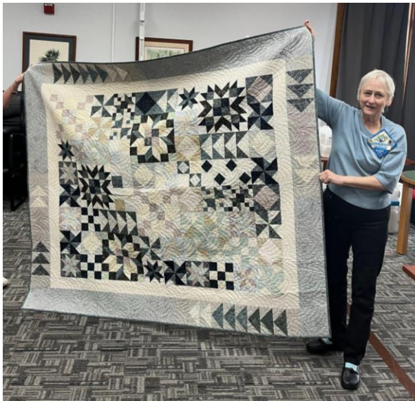
Quilt for Her Husband