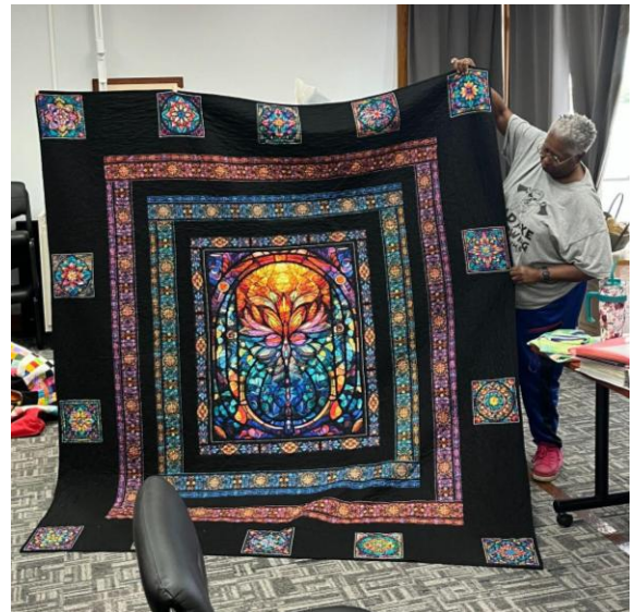
The Medallion Quilt