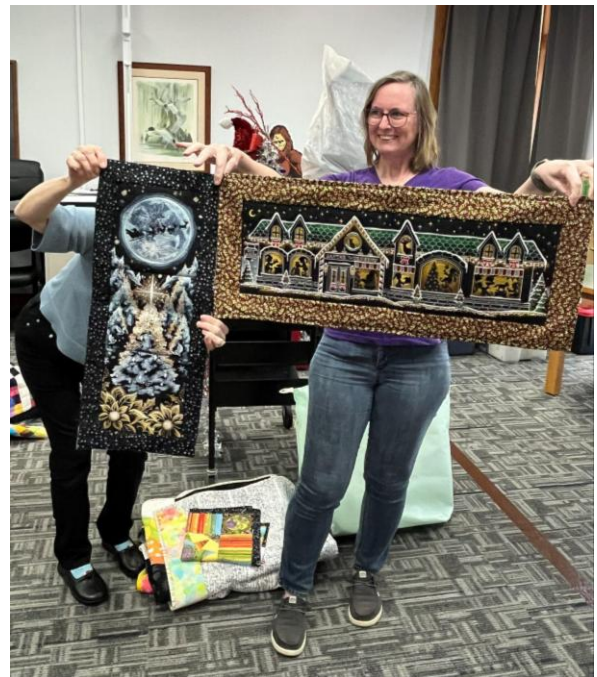
Christmas Embroidery Wall Hangings