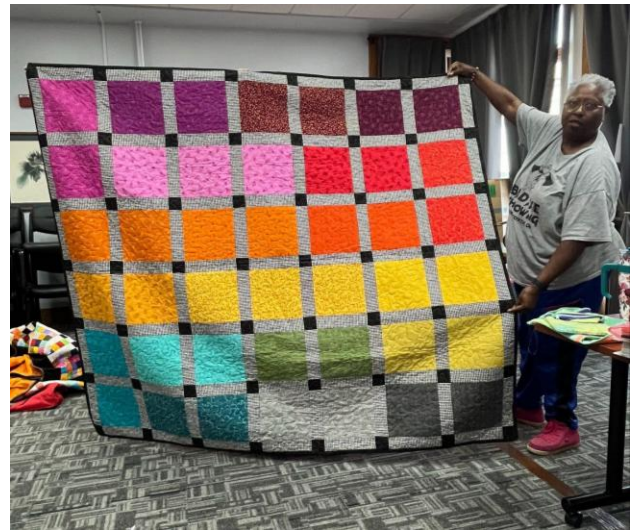
Rainbow Colored Quilt