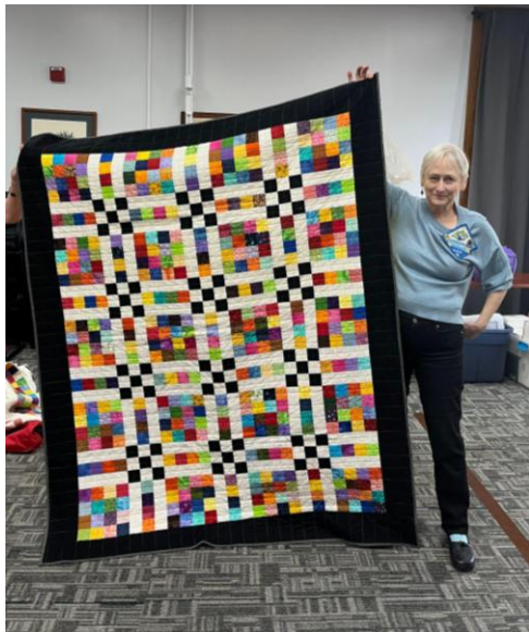
2 ½ Inch Square Quilt