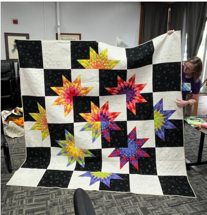
Good Night Star Free Motion Quilting