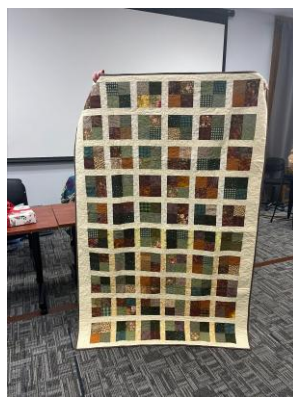
Charity Quilt #3