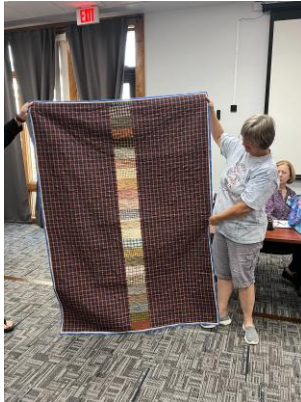
Charity Quilt #4