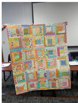
Charity Quilt #1