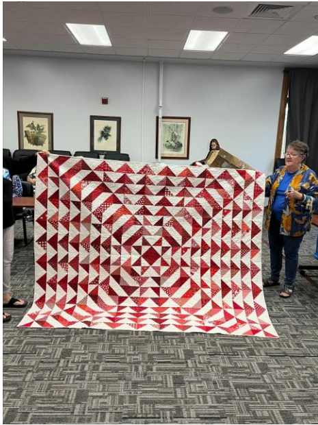
Red Rain Boots