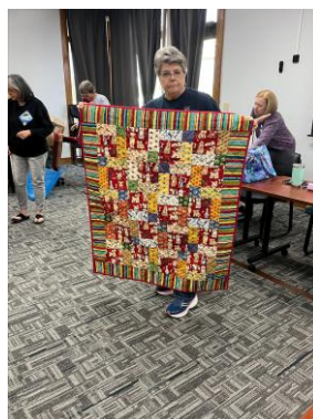
Child Charity Quilt #1