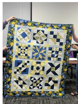
Charity Quilt #5