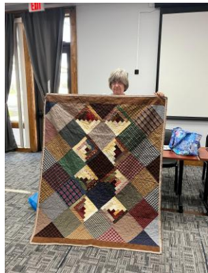
Charity Quilt #5