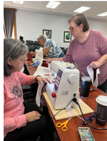
A Little Supervision