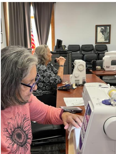
Just Sewing Away