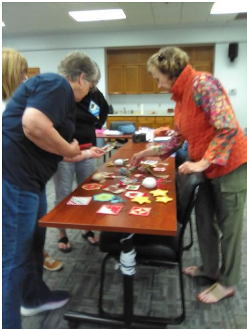
Admiring The Ornaments