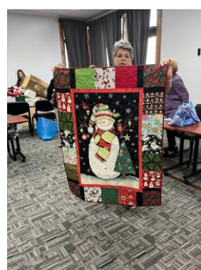
Child Charity Quilt #2