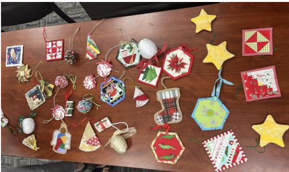
Ornaments From Ten Members