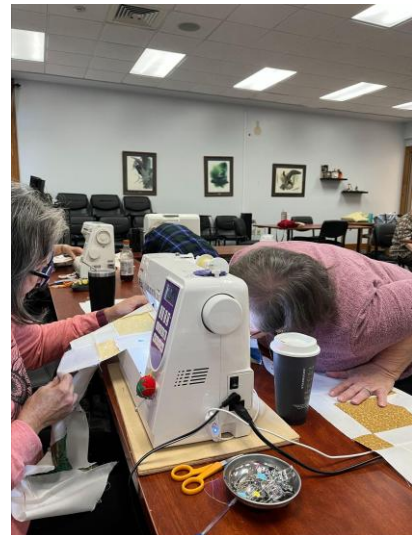
Are You Sure You Are Doing it Right?