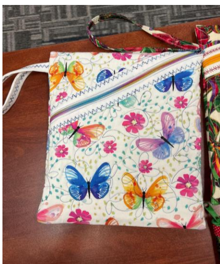
Zipper Bag 10 2025 Program Meeting