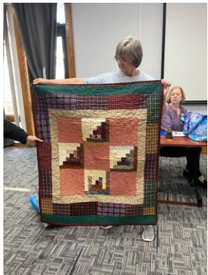
Charity Quilt #3