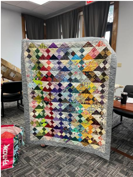
4 Patch and HSTs