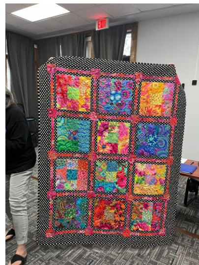
Flowers for my Niece