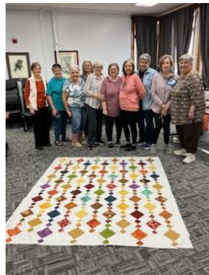
Finished Quilt Top