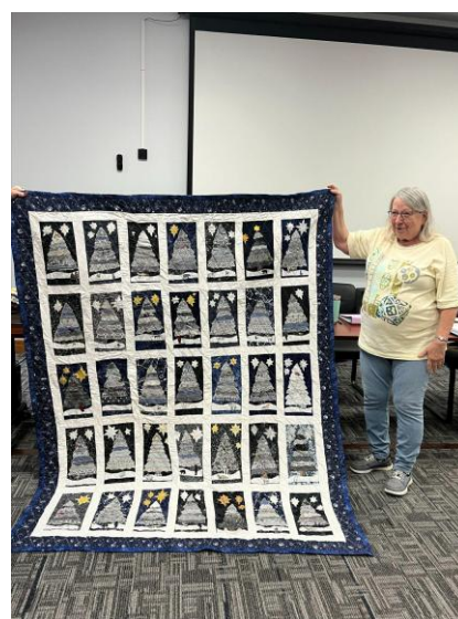
Lotto Win - Appliqued Trees