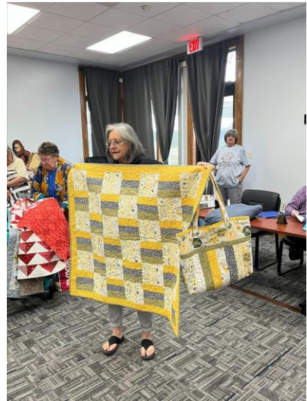
Bee Comfy, Bee Cozy Quilt & Bag