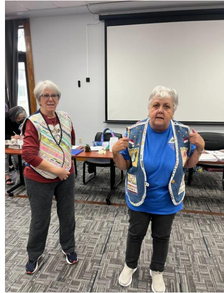
Sewing For a Cause Vests