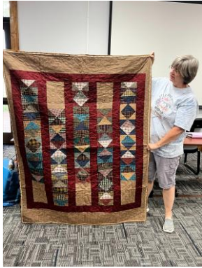
Charity Quilt #1