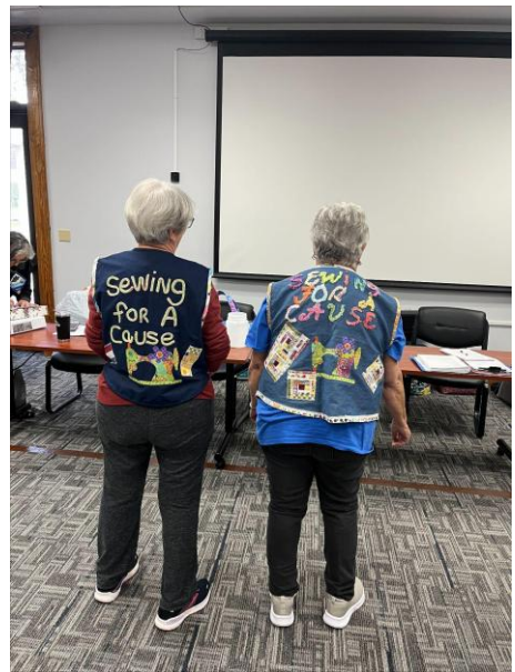
Sewing For a Cause