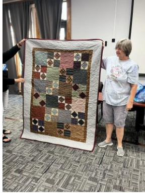
Charity Quilt #2