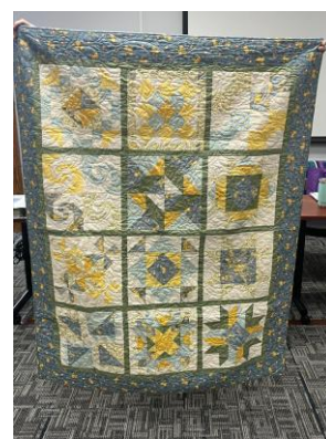
Charity Quilt #4