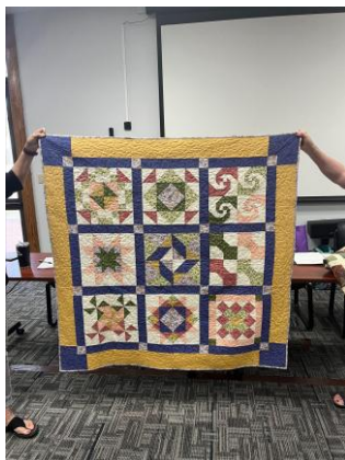
Charity Quilt #2