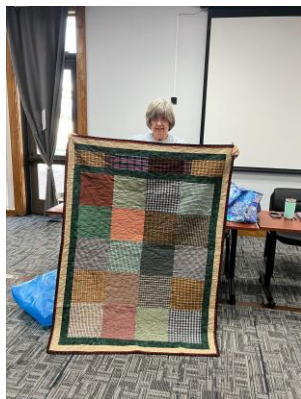
Charity Quilt #6

Thank you members who donated the fabric, batting, unfinished quilt tops, finished the quilt tops, quilted, and put bindings on as the final step in making all these Charity Quilts!!!