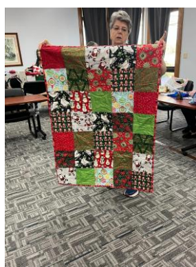
Child Charity Quilt #3