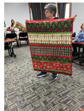
Child Charity Quilt #4