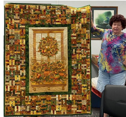
Welcome Autumn Quilt