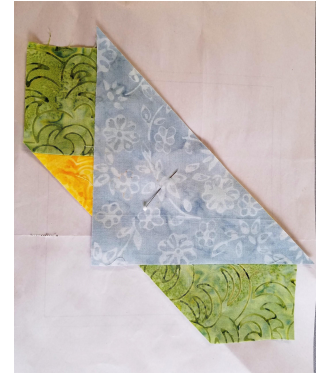
Project in Progress