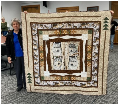
EdsonWolves Quilt Project Meeting