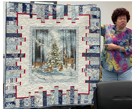
Peaceful Christmas In the Woodlands