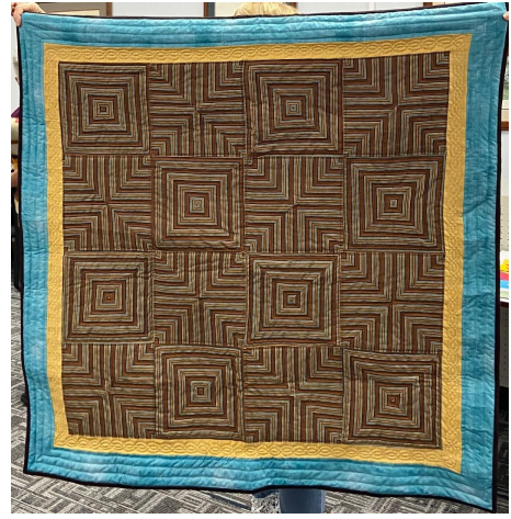
One Fabric Quilt Charity Quilt