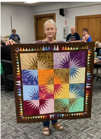
Spikey No-Tan Paper Pieced Quilt