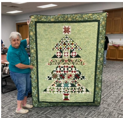
Christmas Quilt Project Meeting