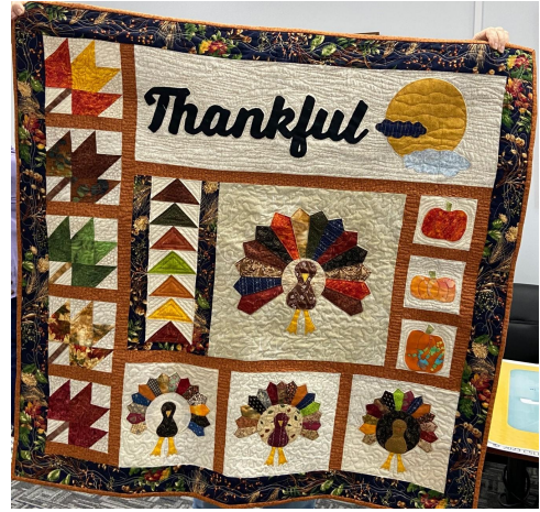
Thankful Charity Quilt