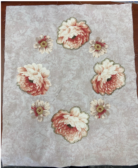
May Lotto Block Broderie Perse Applique Method

The Lotto block for May is a Broderie Perse Applique method of May Flowers. A handout was given out at the Business Meeting. An explanation and example were also presented. The unfinished block should be 12.5 inches by 15.5 inches with a floral theme. Use colors of your choice. The size of your flowers will determine how many flowers and stems will be in the block. It is due at the May 11th Business Meeting at the Quilt Show Set-up.