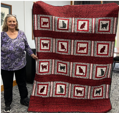
SPCA Charity Quilt