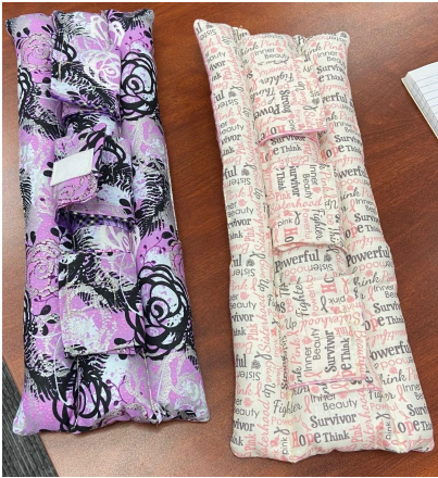
Seat Belt Pillow for Breast Cancer