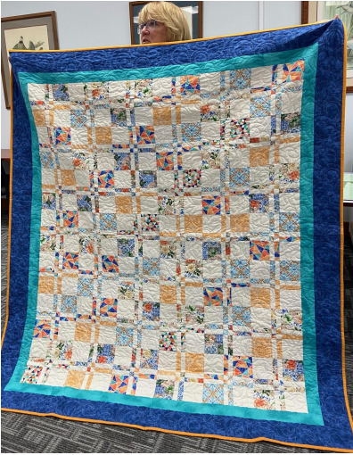
Disappearing 4 Patch