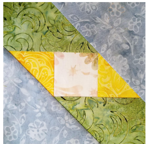
Paper Piecing Completed Project