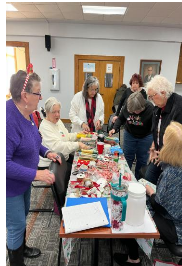
All Together Now - Wrap!!