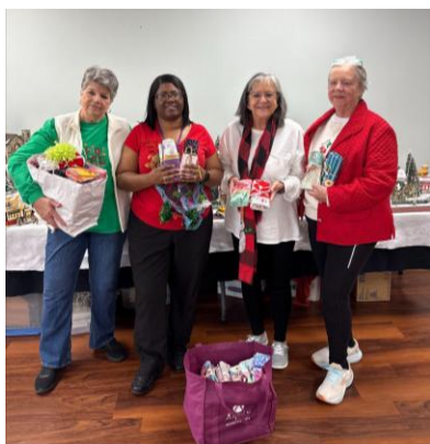
Presenting Pillowcases to Dunbar Village