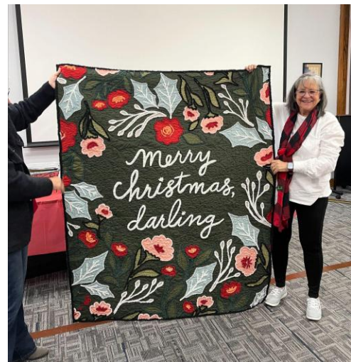
Merry Christmas Darling Chenille Quilt

October 22, 2026, at 1:00 pm Table Runner