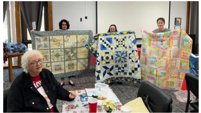
All Three Librarians Together!!

Three Librarians were presented with quilts with the quilt for the fourth librarian who was not working that day sent with them. They were very appreciative!