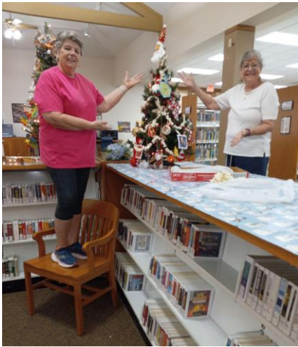
Admiring Work Done