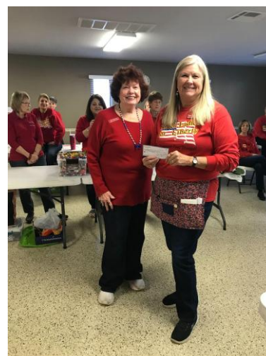
Presenting check to Ladies of Liberty

What charities will receive the other half of the Quilt Show funds will be determined next year. The proper applications will have to be submitted.