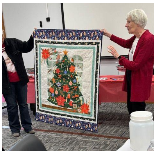
Christmas Tree Quilt