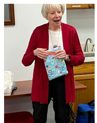
Diagonal Zipper Bag