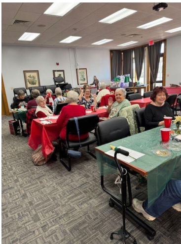
Fun Was Had By All!