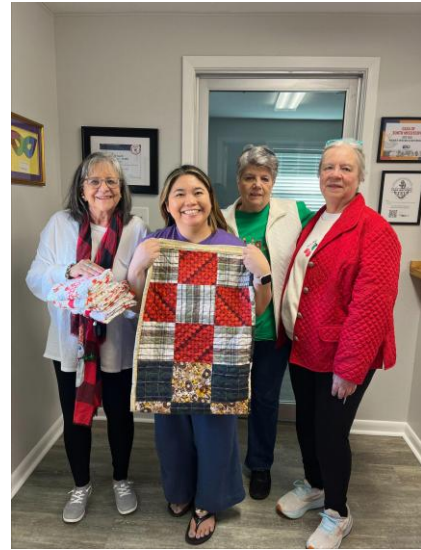
Presenting Quilt & Pillowcases to CASA