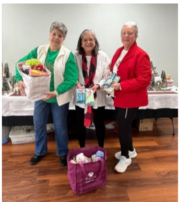
Pillowcases Ready to be Delivered