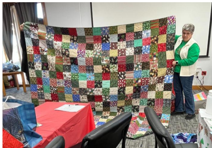
Christmas Patchwork Quilt