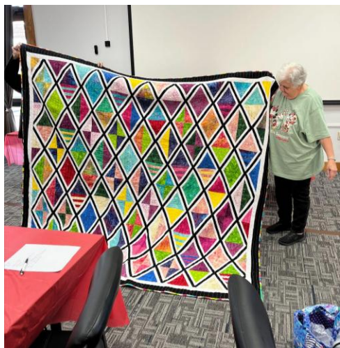
Sew'N Draw - Set Sail