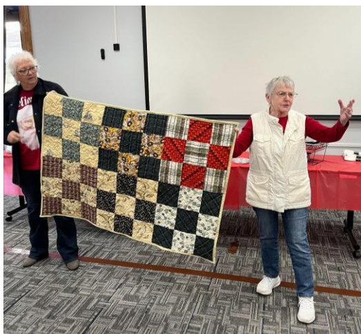
Charity Quilt for CASA