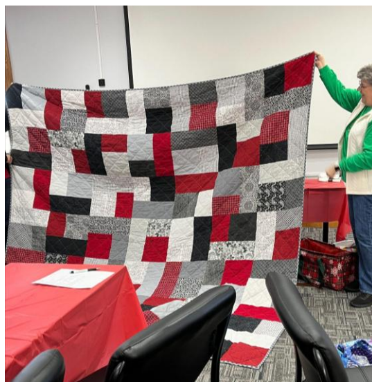
Daughter's Turning Twenty Quilt