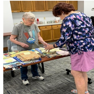
More Shopping at White Elephant Sale

Our Program Meeting was a White Elephant Sale with about 12 members set up to sell items relating to quilting and craft projects. Items included were patterns, fabrics, books, templates, and kits. It was held on April 27th at the Kiln Library with about 25 shoppers. Twenty percent of a member's sales was given to the guild.