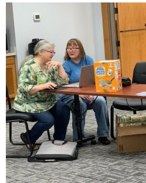
Working on 2023 Quilt Show Brochure