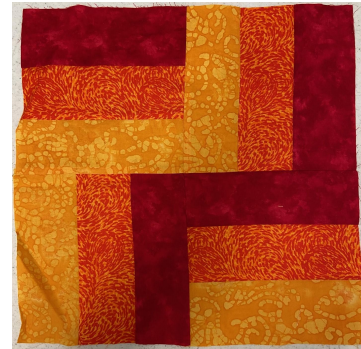
June Lotto Block 5 Seam Rail Fence

http://www.quilterscache.com . It is due at the June 8th Business Meeting.