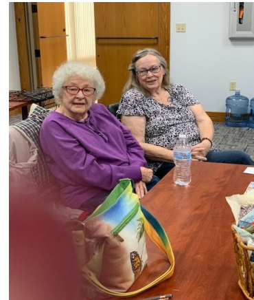
Resting and Catching Up