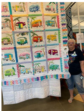
#38 Let's Go Camping