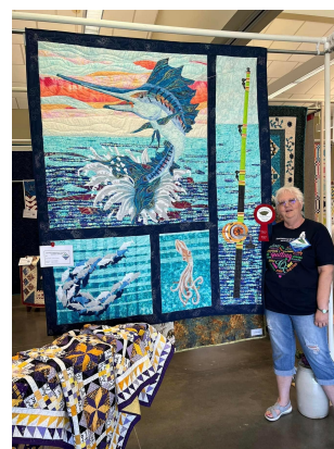
#30 Into the Deep