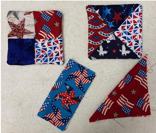
Coasters for GSQA July Meeting