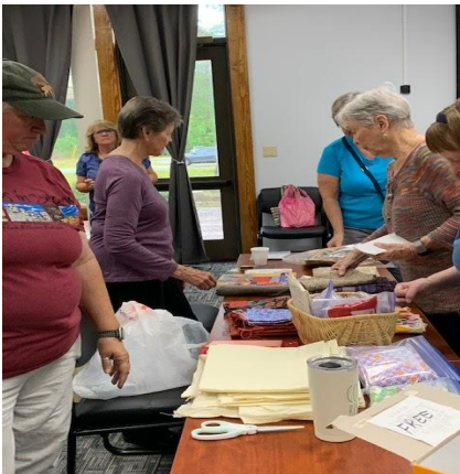
Shopping at White Elephant Sale