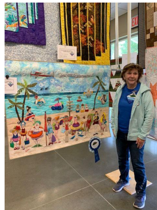
#94 Bay Oaks Bathing Beauties