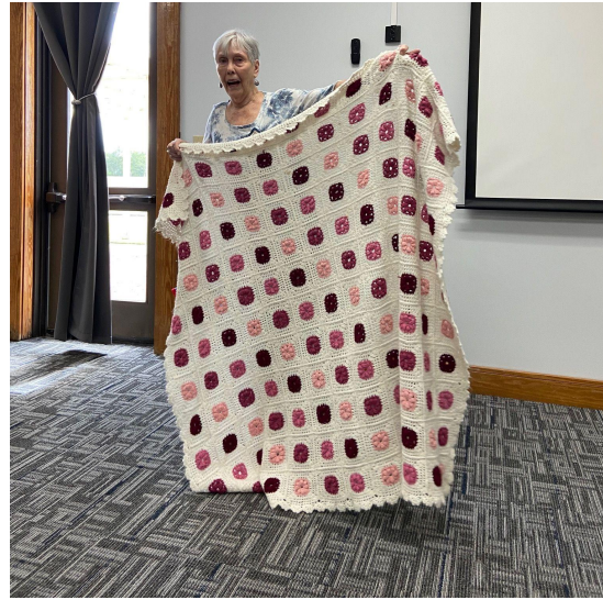
Gloria's Crochet Afghan