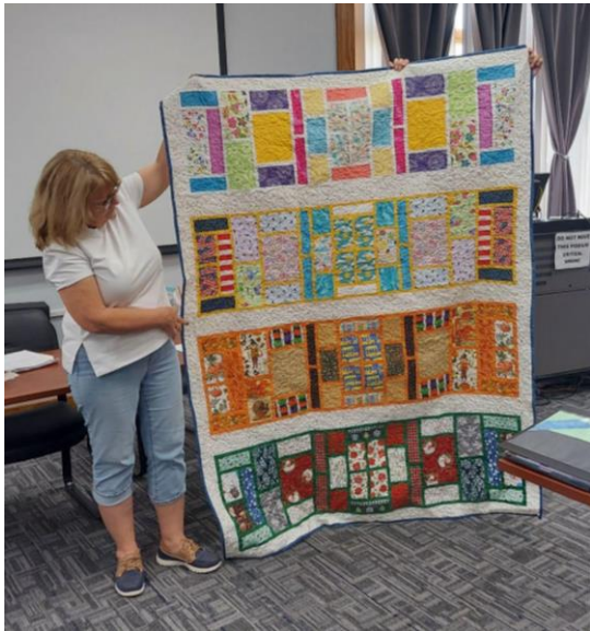
For Everything There is a Season Quilt