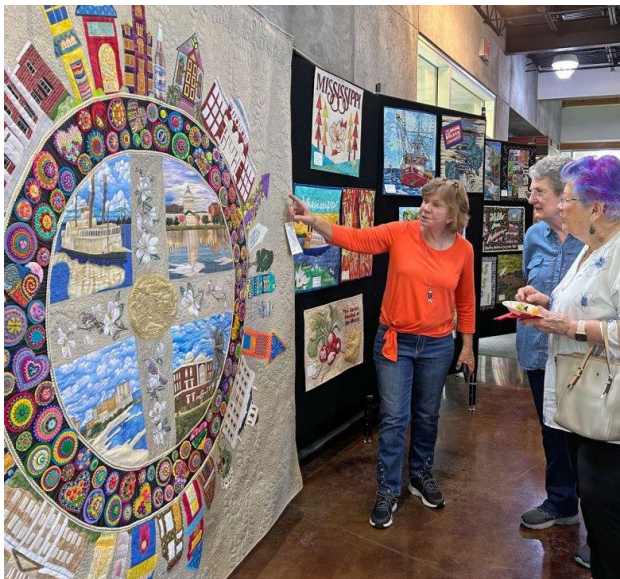
Fiber Artists Show