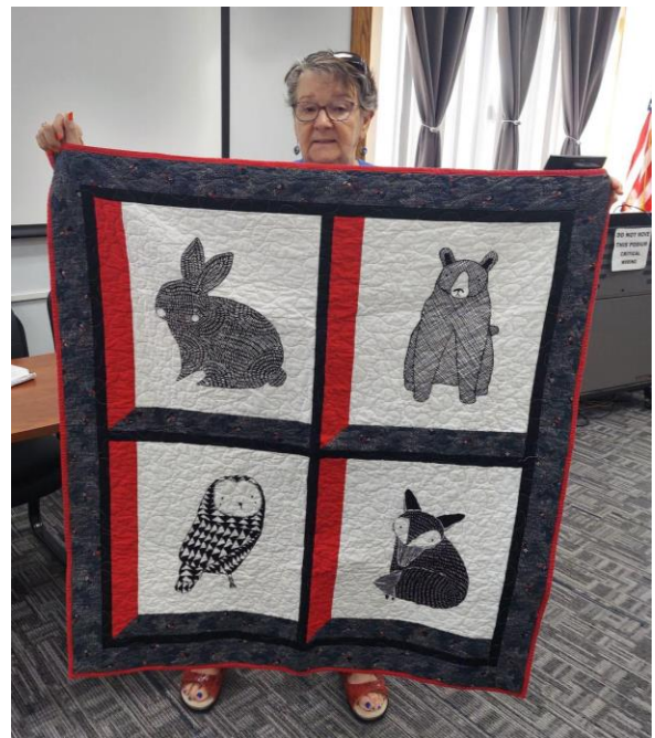
Attic Window Charity Quilt