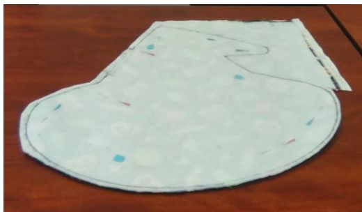
Sewn Before Final Cut Then Turn Inside Out to Close