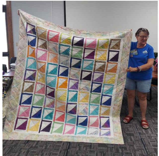
07 2024 Sew'N Draw - Magic Carpet