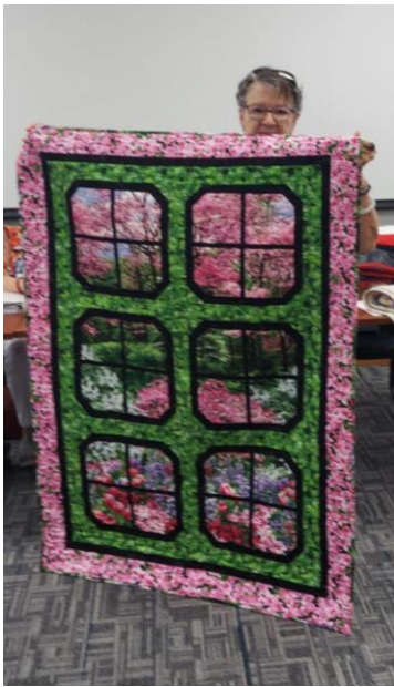
Springtime Window Quilt