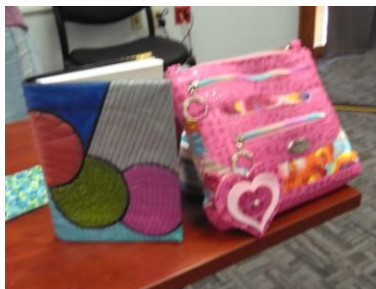
Book Cover and Purse

Deana next demonstrated how to repair tears in quilts by using Fabric Sheets and a powder fabric glue named Bo-Nash Fuse It.