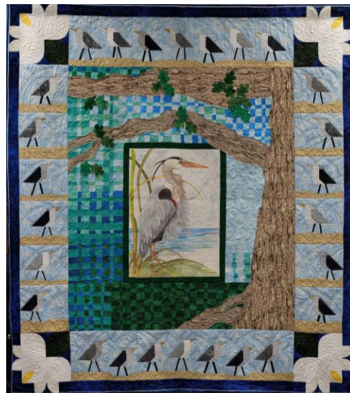
Coastal Reflections - Finished!