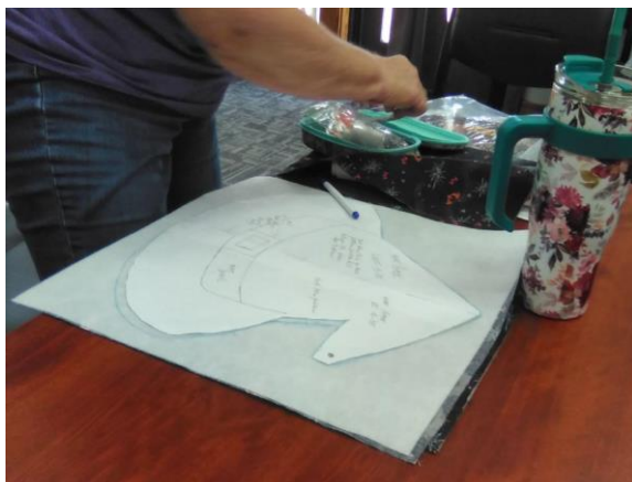
Pattern on Fabrics