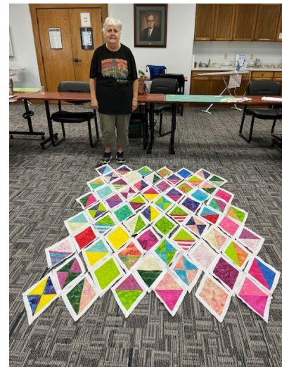
The Winner - Pam Blais