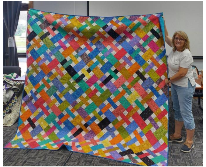
Louisiana Shop Hop Weave Quilt