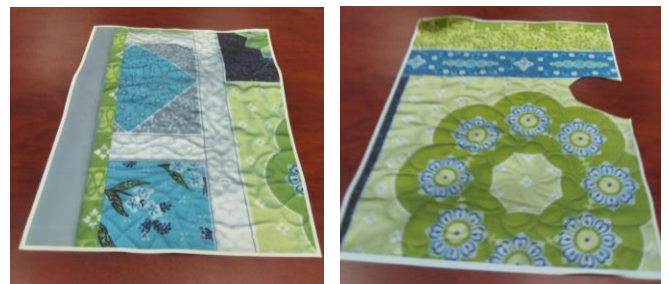
Two Fabric Sheets To Be Used For Repairs

A person "copies" their fabric onto a fabric sheet that goes through an inkjet printer. A piece can then be cut from the sheet and be used to repair a quilt.