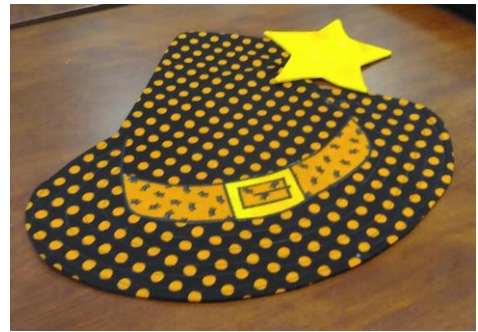
Halloween Placemat - Star Detaches for Coaster