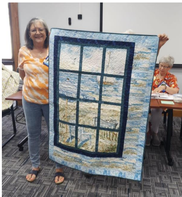
Beach Scene Window Quilt