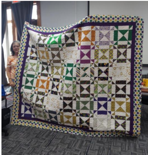
01 2024 Sew'N Draw – Shuttered