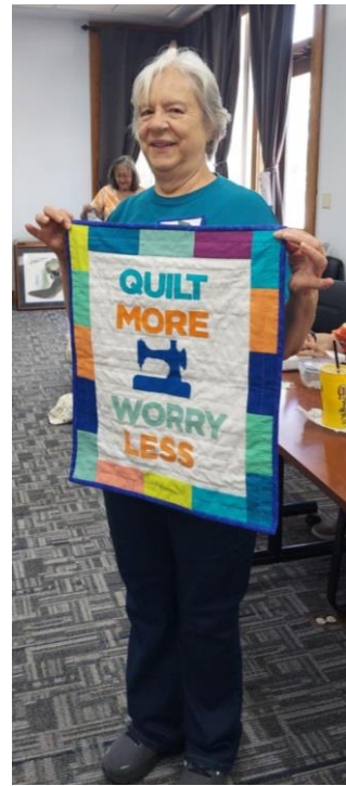
Quilt More, Worry Less