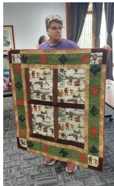
Evergreen Light Attic Window Quilt