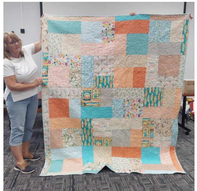
Turn & 20 Quilt