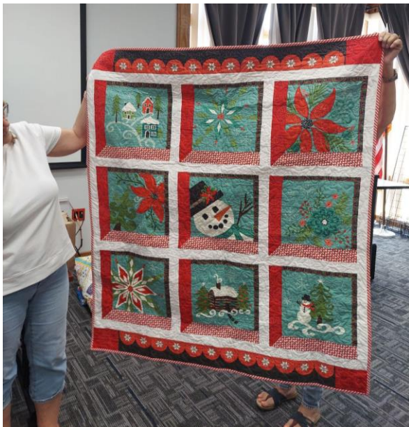
Frosty Days Attic Window Quilt