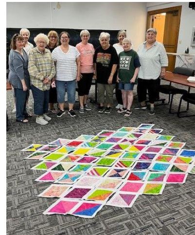
Set Sail by Jaybird Quilts