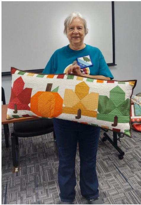
Fall Bench Pillow