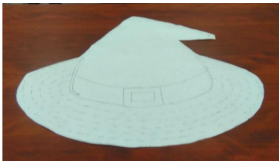
Pattern on Freezer/Parchment Paper