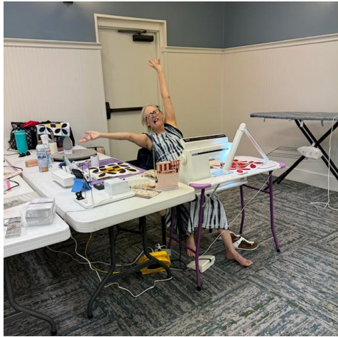
Working and Stretching! Look Mom - No Shoes!