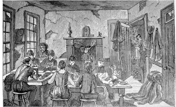
CLOAK MAKERS—No. 12 HESTER STREET, TOP FLOOR. This illustration appeared in the Third Annual Report of the Bureau of Statistics of Labor, State of New York, for the year 1885. It is a scene typical of sweatshop conditions which were due to be corrected by labor legislation. NEWS MAGAZINE—N. Y. STATE DEPARTMENT OF LABOR 13