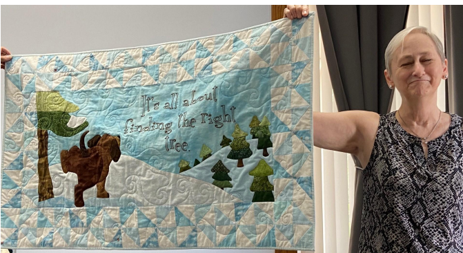
Kay Guillot - The Right Tree