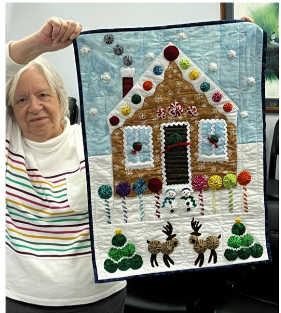
Candy Cane House