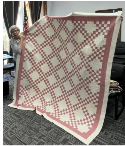
Sweet Pink & White Charity Quilt