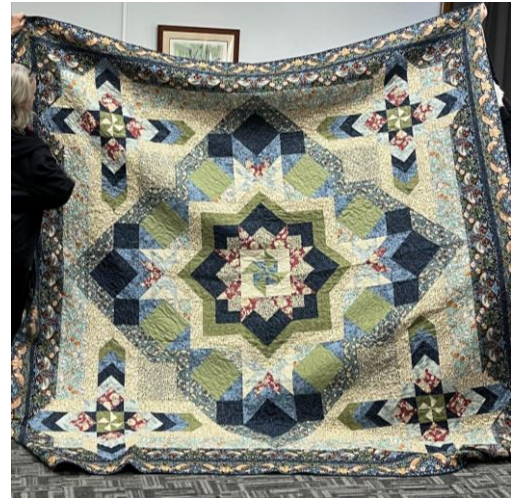
Star and Crosses