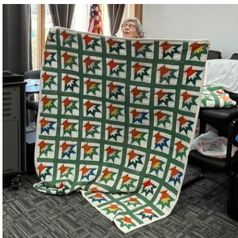
Flowers Charity Quilt