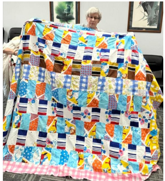
Charity Quilt Top #1