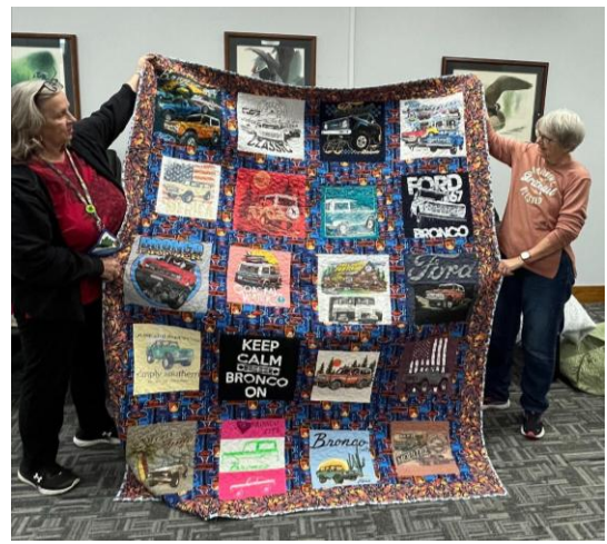
Keep Calm and Bronco On