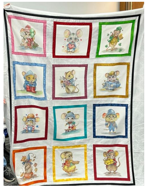
Mice Calendar Quilt