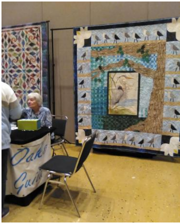
Selling Opportunity Quilt Tickets