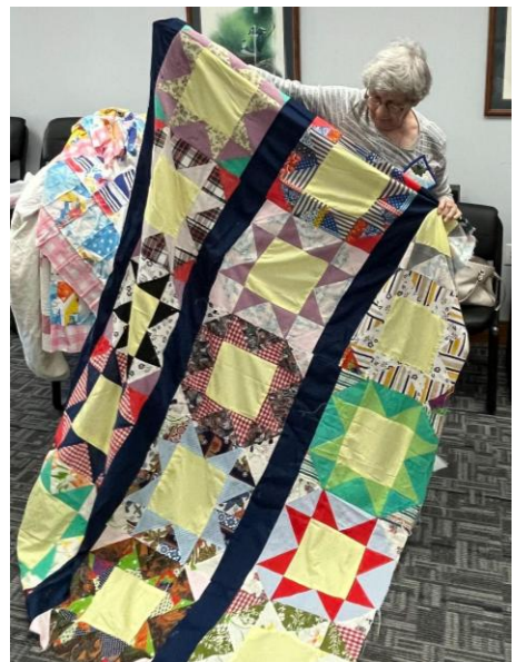
Charity Quilt Top #2