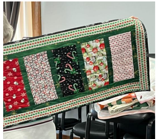
Finished Last Night Table Runner