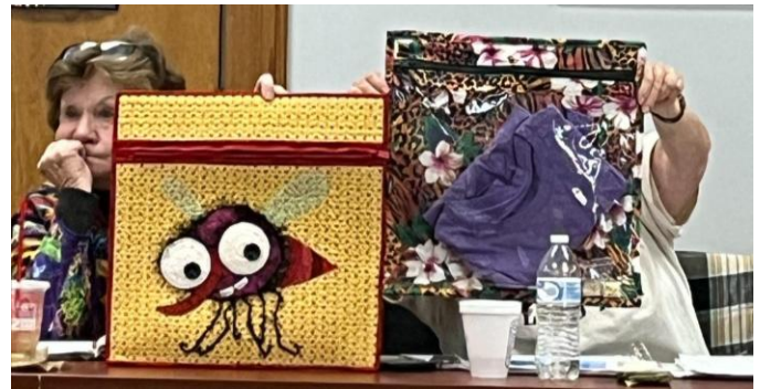
Examples of Project Bags

Michele M volunteered to conduct the February Program Meeting to make a zippered project bag. Members should bring a 16-inch zipper, fabric, binding and sewing machine. Michele will bring the vinyl.