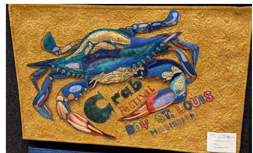
Fiber Art Entries