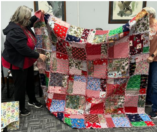
Husband's Christmas Flannel Quilt