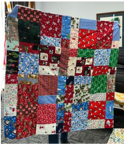
Christmas Flannel Quilt