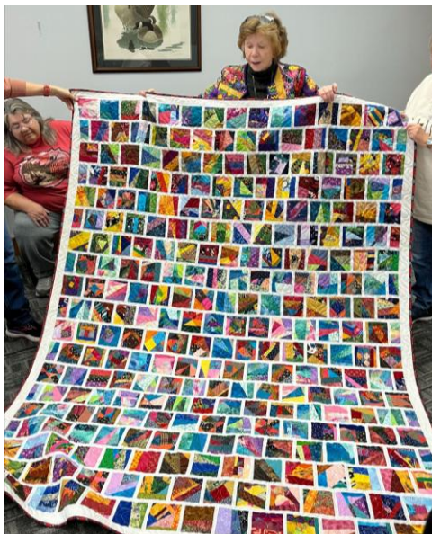
Little Pieces of Scraps