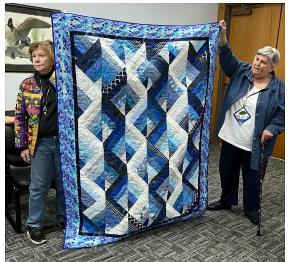
Rhythm in Blues