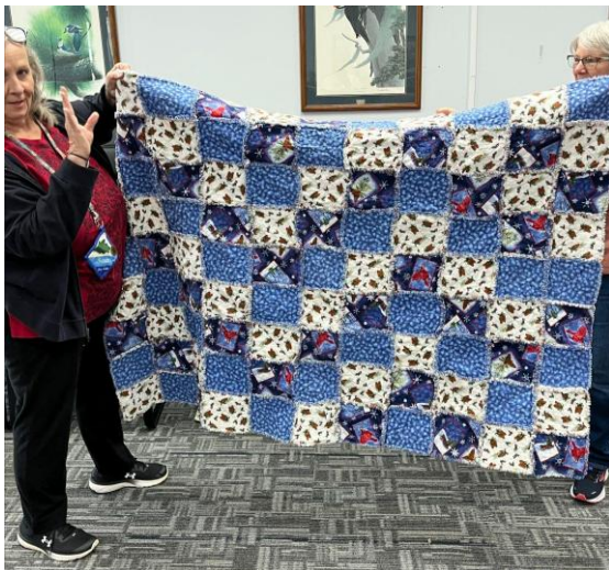
Flannel Quilt in Blues