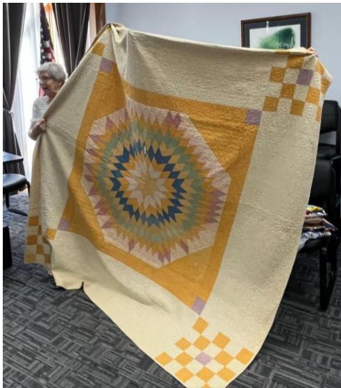
Arizona Star Charity Quilt