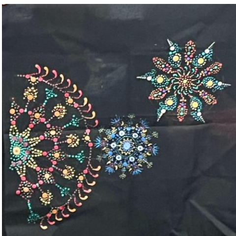
Dots #2 April Holifield