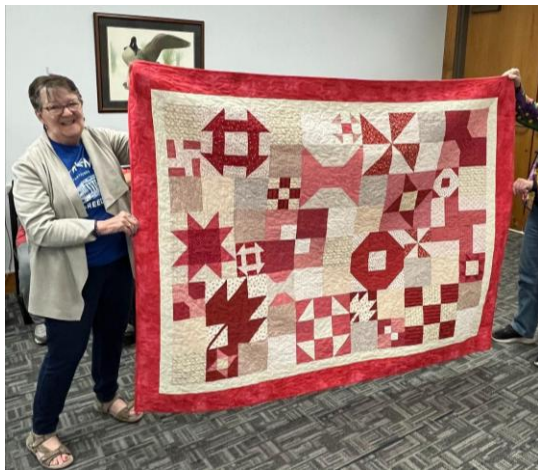
Pink Block of the Month