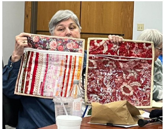
More Examples of Project Bags