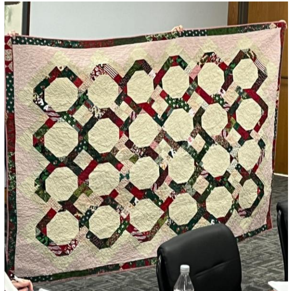
Example of Beachside Bungalow

Michele M will oversee Sew 'N Draws for 2025. She announced that the next Sew 'N Draw would be Saturday, March 1, 2025, in the Kiln Library Meeting Room from 9am - 3pm. The pattern will be Beachside Bungalow. Material list will be sent out.