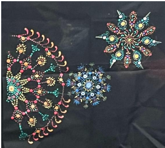
Fabric Painting Example

You will be able to design all three blocks and have enough to take home and play on some of your blocks.