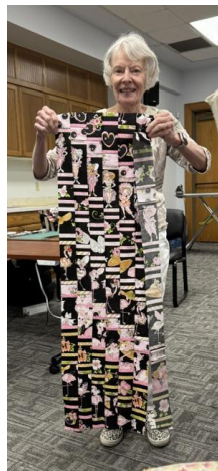
A Work in Progress