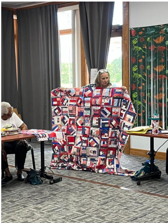
No Think Quilt Top In RW&B Squares