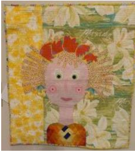
Portrait Examples From Pearl Squires

She also suggested that members make some decisions before class. Do you want a portrait of yourself or someone else? What fabrics to use? Yardage is not needed, just fat quarters. She suggested bringing multiple possibilities to allow for choice. Pearl will have designs for eyes, noses, and mouth. She sent a document with these designs which were e-mailed to membership on June 5th. She will also bring examples.