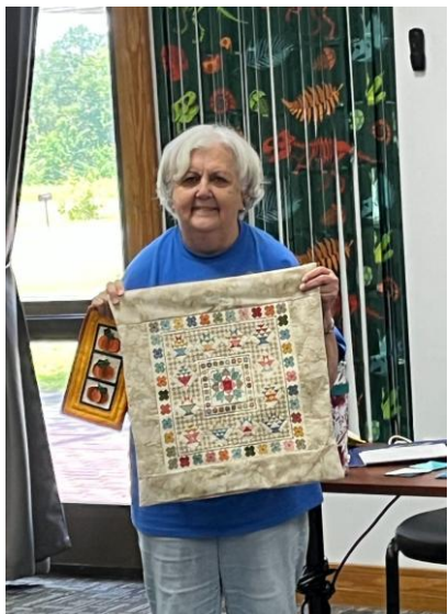
Cross Stitch Quilted Wall Hanging