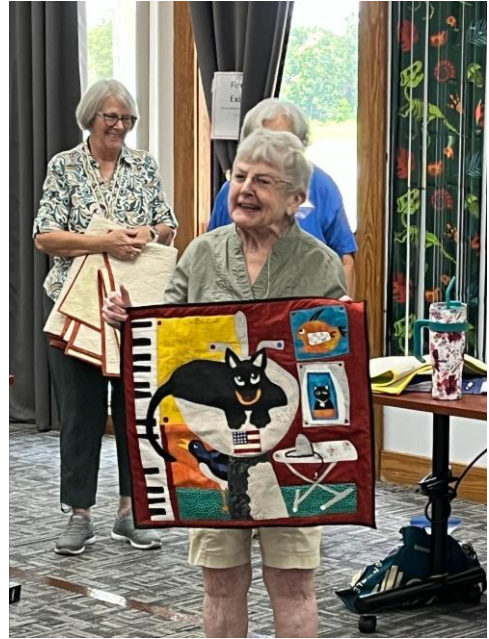
My Cat's Favorite Things