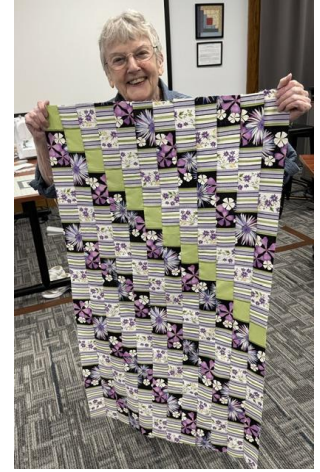
A Good Start!