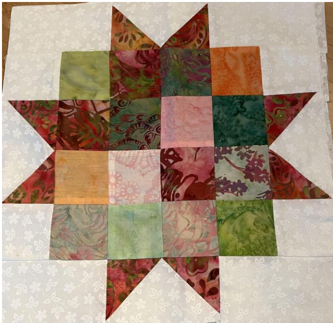
Mystery Quilt Step #5- Corner Stars

Therese showed members the Step #5 Block. There will be 6 steps in all - a new step each month – the quilt will be 88 inches by 88 inches in size. Therese gave out the instructions. Debra L e-mailed out the instructions to members and posted them on the website.