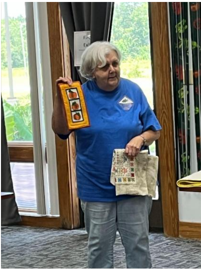
Miniature Pumpkin Wall Hanging