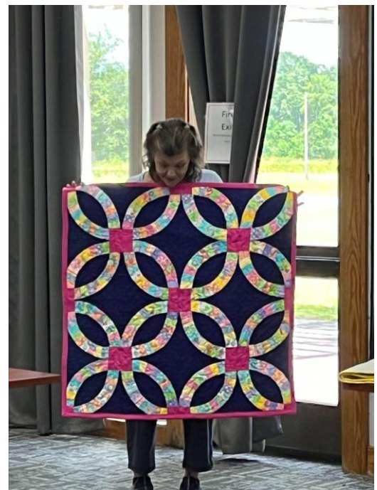
The Double Wedding Wall Hanging