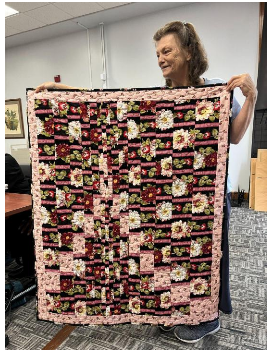
Fauxello Quilt - Veterans' Home Donation