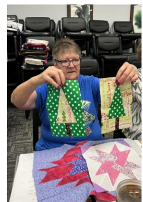
Two Trees Opposite Fabrics