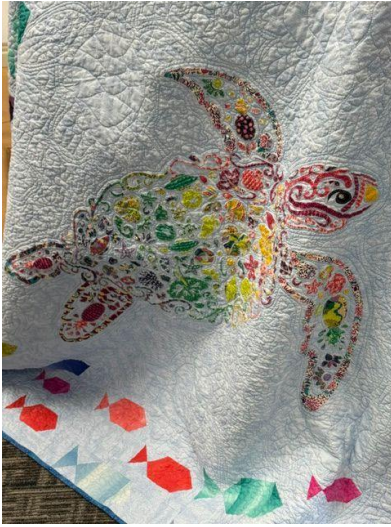
Turtle Close Up