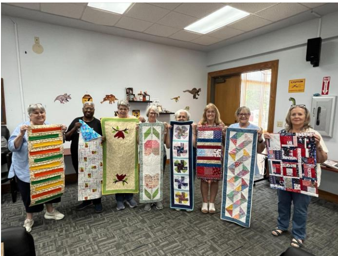
Table Runners for the June Swap were due at the June 11, 2026, Business Meeting. Eight members participated in the June Swap!

Eight Guild members present the project for their month that they signed up for at the Business Meeting the month prior. The list is as follows and is subject to change: