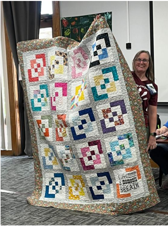
GSQA Lotto Blocks