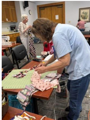
Members at Work