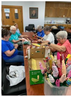
A Production Line!