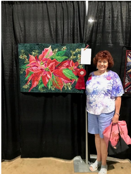
Second Place Applique Division