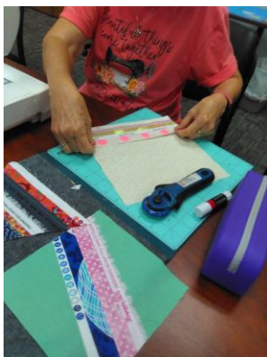
Making Selvage Fabric to Cut or a Selvage Block