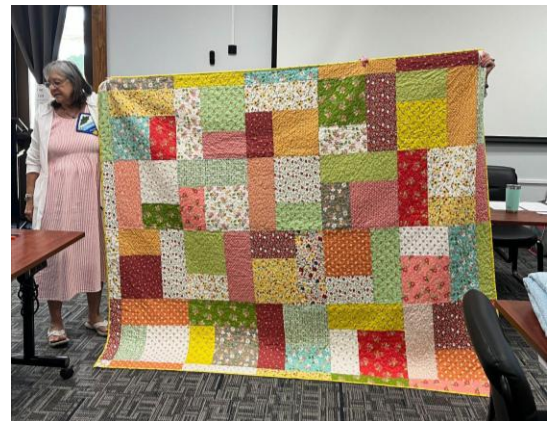
Turning Twenty Quilt #2