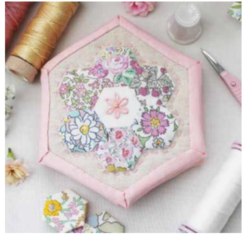
English Paper Piecing Project