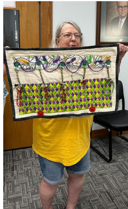
Mardi Gras Float