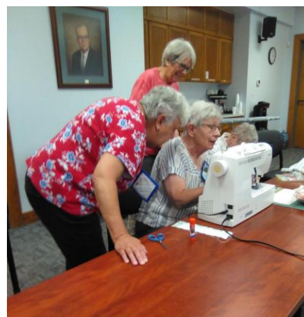
Trying to Fix a Sewing Machine in Order to Carry On!