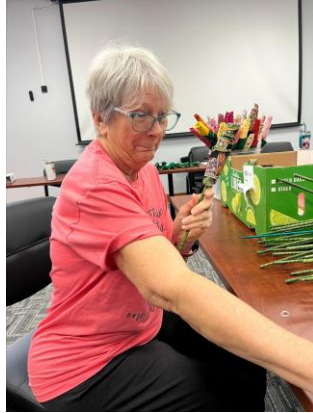
Making the Roses