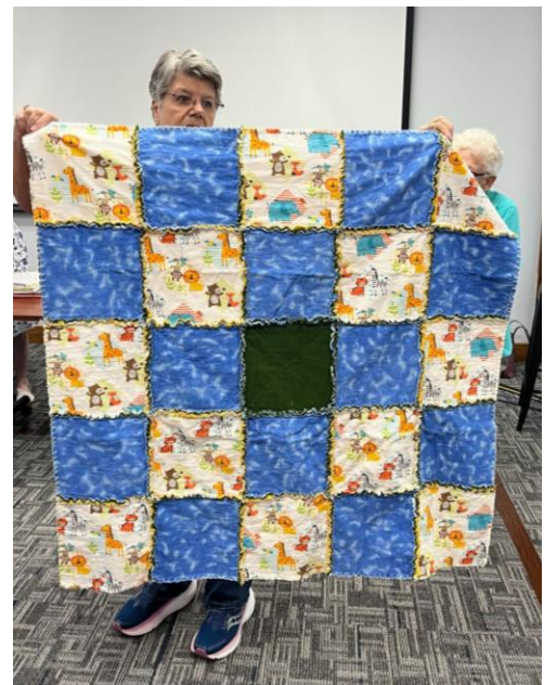
Baby Rag Quilt With Squares