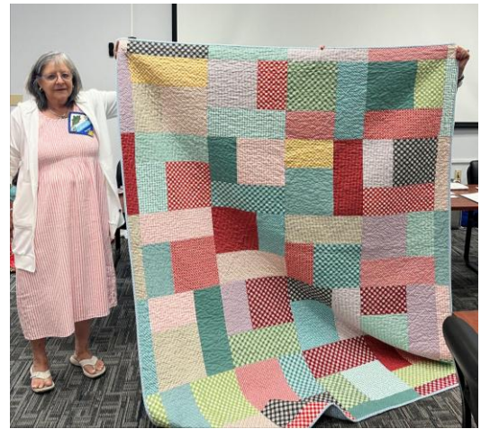
Turning Twenty Quilt #1