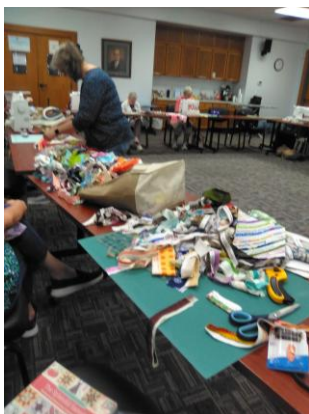
Selvages, Selvages Everywhere!