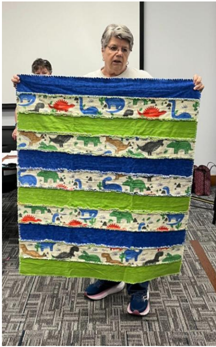
Baby Rag Quilt With Strips