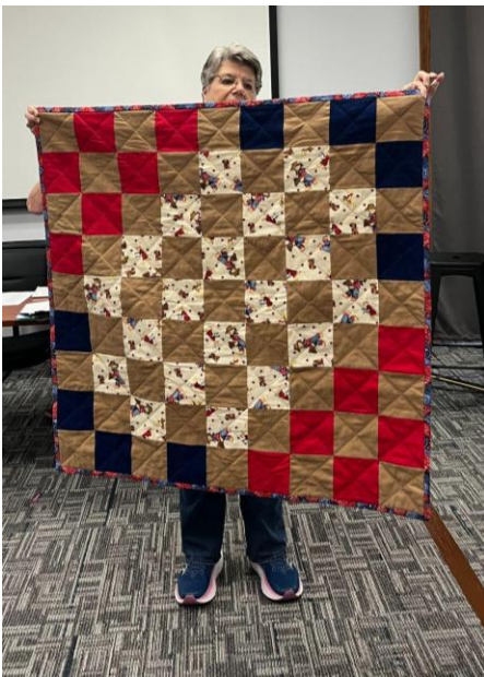
Baby Flannel Quilt with Flannel Squares