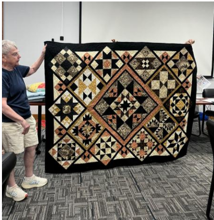
Reaching for the Stars Donation Quilt for Magdalene House Silent Auction Fundraiser