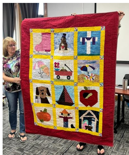
Calendar Quilt #1