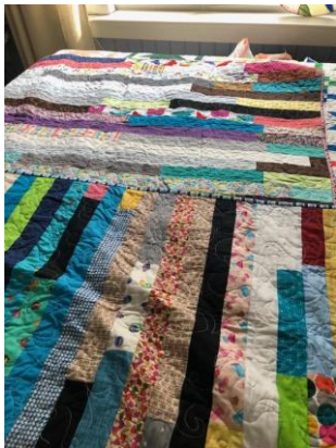
Donation Quilt 2 of 5