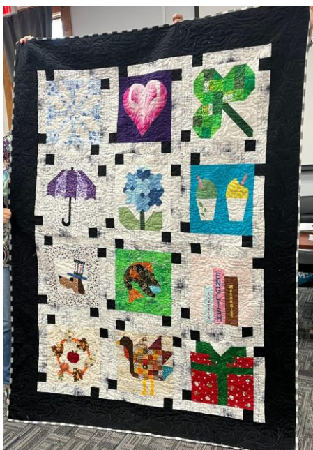
Calendar Quilt #2