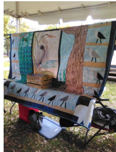
Second Attempt & Third Attempt A Bungee Cord Used on Quilt Bottom and Table