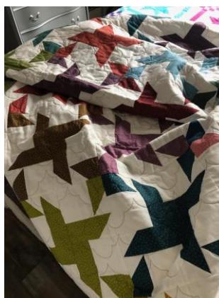
Donation Quilt 1 of 5