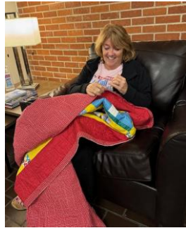
Sewing on Bindings