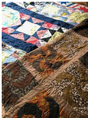
Donation Quilt 2 of 5

Members donated finished quilts and quilt tops - 27 in all! Other members finished the quilts. Most have been sent for Hurricane Relief to North Carolina. A few more came in and more to come!