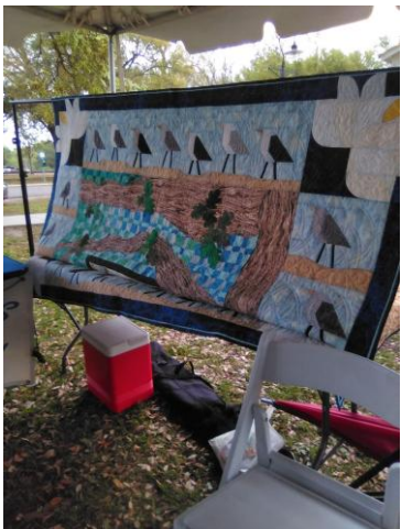
First Attempt to Set Coastal Reflections Windy Conditions