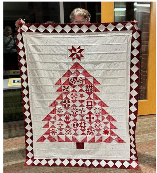
Red Tree Quilt Top