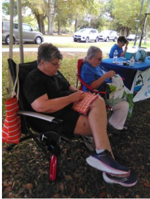
Sewing Binding on Quilted Potholder