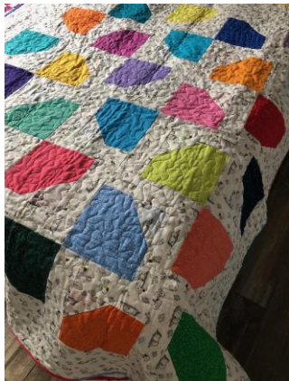
Donation Quilt Last of 5