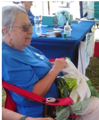
Embroidering Stars on Quilt Top