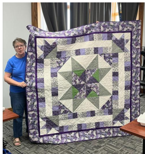
Purple Mystery Quilt