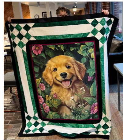
Puppy Baby Quilt