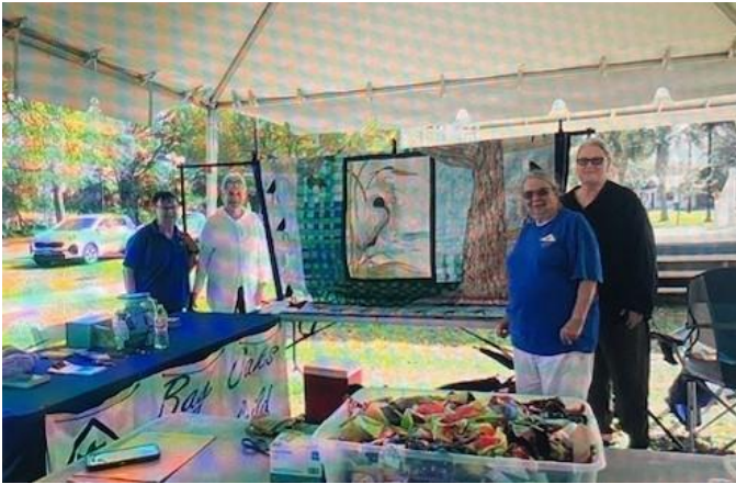
Setup Finally Complete!