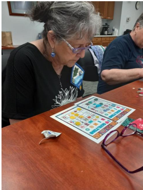
Color Coded Buttons!!