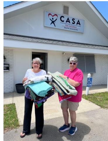
11 Quilts for CASA

The BOQG Board agreed that Guild members may make pillowcases for the Woodland Village Retirement Home in Diamondhead, MS for Christmas 2026. 120 pillowcases are needed. It was suggested that they be generic as items are not always returned after laundering.