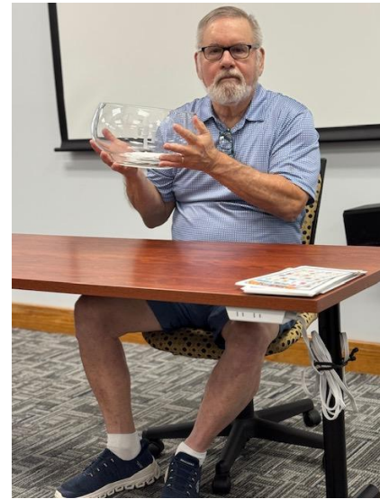
The Caller This Year