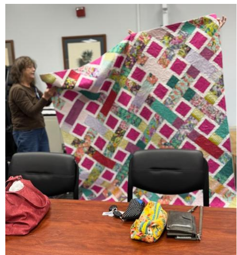
Moon Garden Terrace