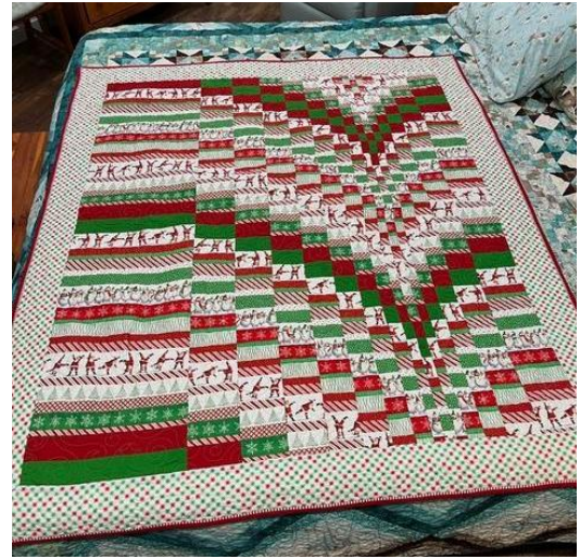
Fauxello Quilt Example