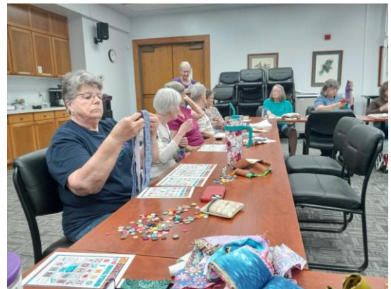
Getting Ready to Play QUILT-O