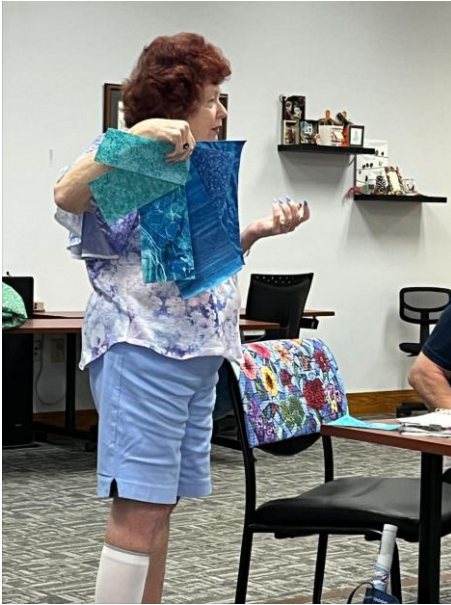
Choices for Stained-Glass Fabrics