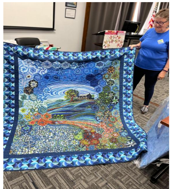
Bluebonnet Path (One Block Wonder)