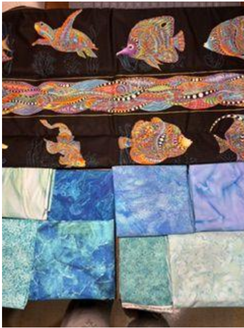
Choices for Main Objects and Stained-Glass Fabrics