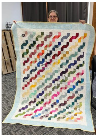
Scrappy Rainbow Quilt