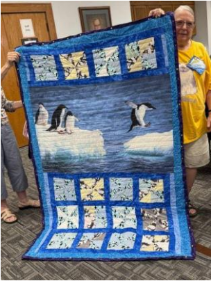
For Joy - Front and Back