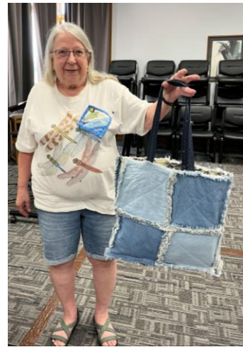
Denim Revival Tote Bag