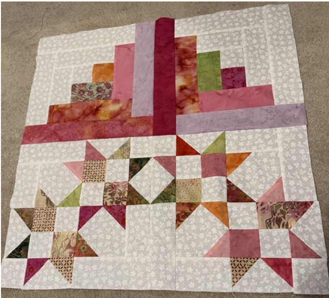
Mystery Quilt Step #4- Log Cabin & Side Unit