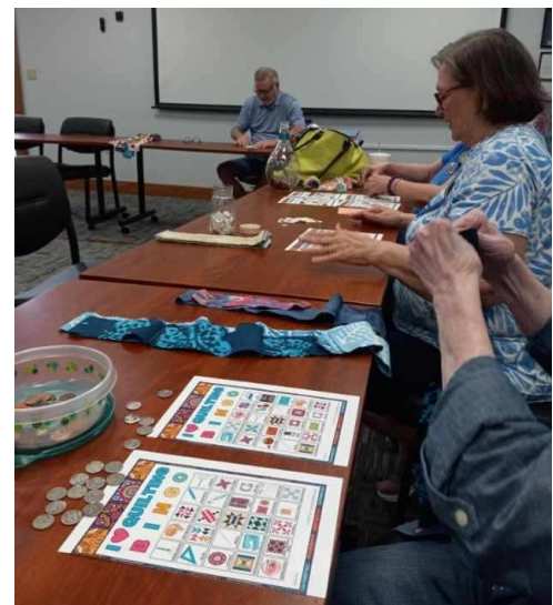
Buttons at the Ready!