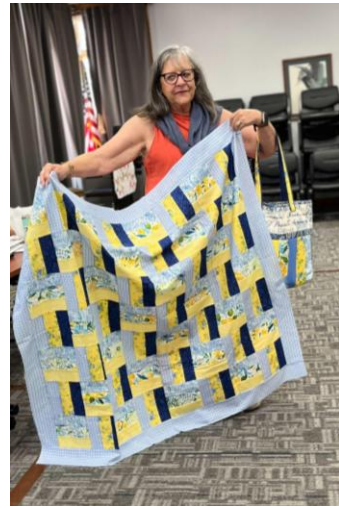
Quilt Top & Tote for Granddaughter