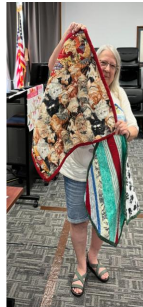
2 Kennel Pads