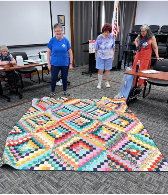
The Wedding Quilt