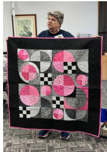
Girls Like Pink