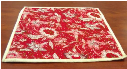
Michele's Finished Project Bag Back

After the meeting, a document was e-mailed to members on how to make the project bag.