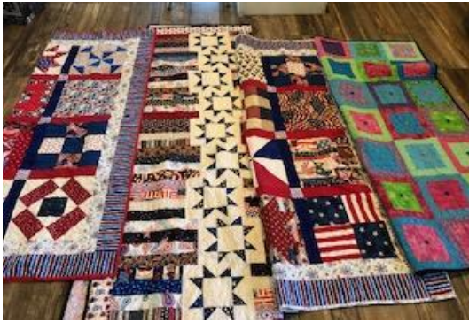
4 Quilts Finished by Members