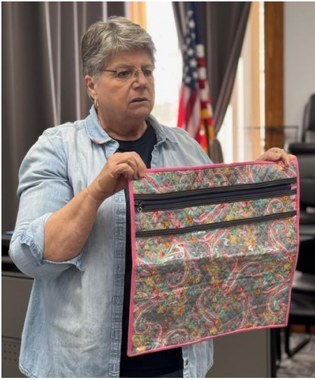
February's Program Bag