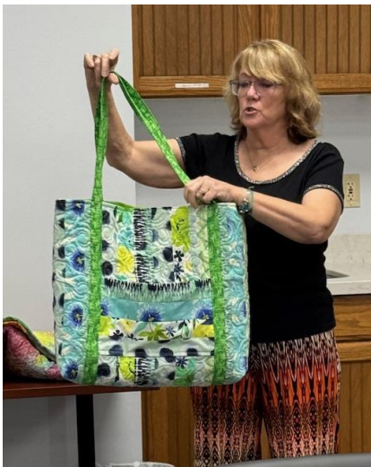
Jelly Roll Bag