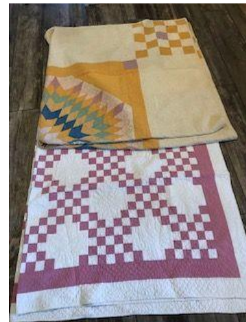
Quilt Tops Finished into Quilts by Members