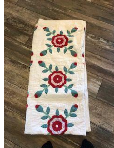
Donated Finished Quilt

Members donated finished quilts and quilt tops - 21 in all! Other members finished the quilts. These will be donated for Hurricane Relief in North Carolina.