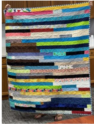
Charity Quilt #1 and Charity Quilt #2