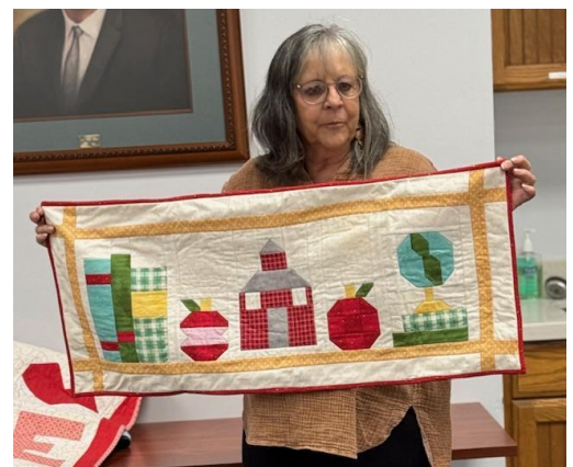
School Quilt Wall Hanging