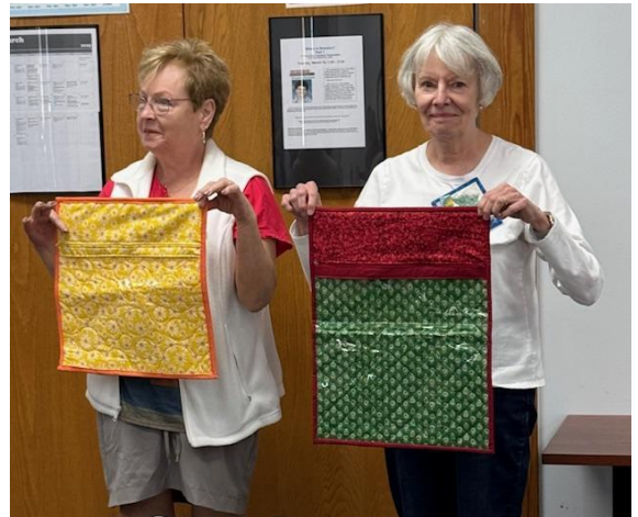
February's Program Project Bags Completed