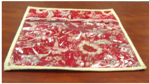
Michele's Finished Project Bag Front