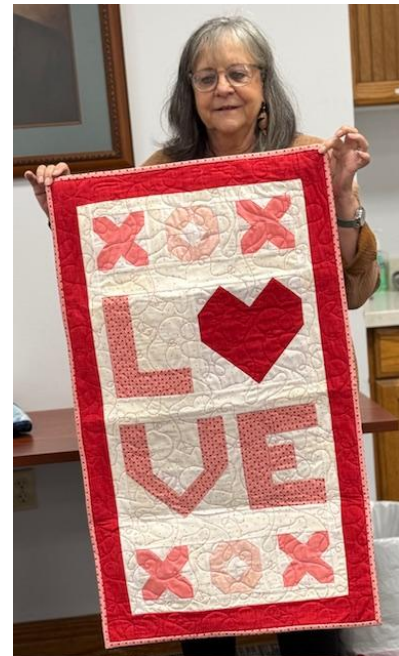
February Door Quilt