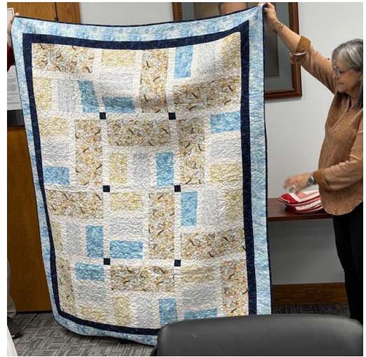
Quilt for Granddaughter's Teacher