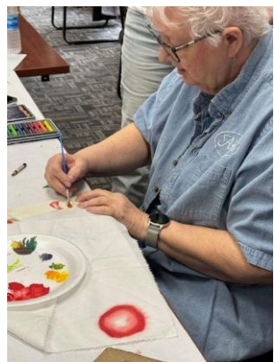
Instructing by Doing!