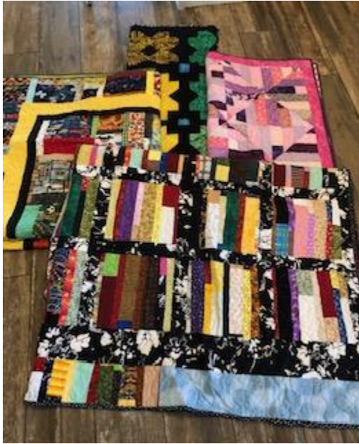
4 Quilts Finished by Members