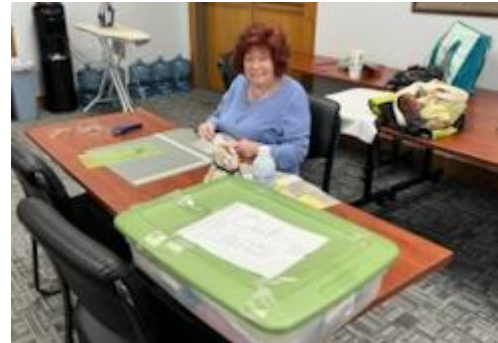
Member Assembling Blocks