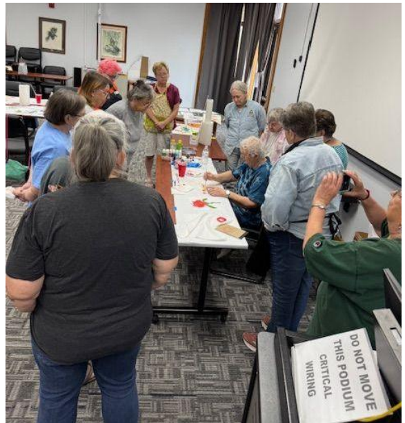
Getting Closer Instructions All Together Now!!