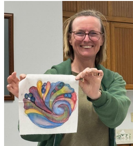
Some Finished Painted Projects