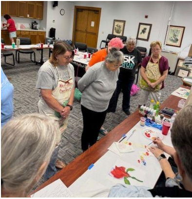
Getting Closer - Beautiful Colors!