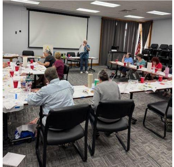
Full Class Instructing