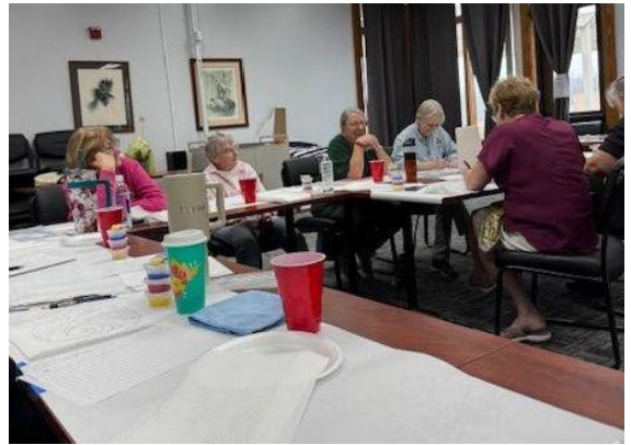
Materials Distributed and Participants Await