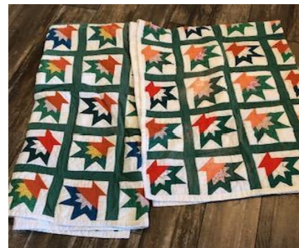
3 Quilt Tops Finished into Quilts by Members