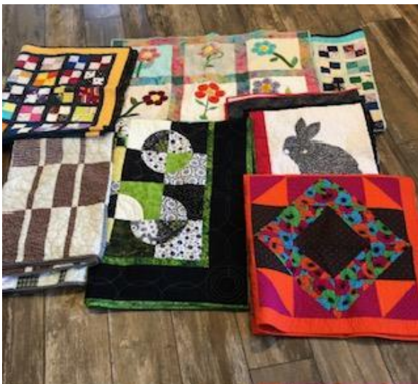
7 Quilts Finished by Members