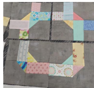
Four Blocks Form 1 Large Block