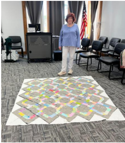
Winner of the Beachside Bungalow Squares

After the Sew'N Draw Meeting, a document was emailed to members on how to make the quilt.