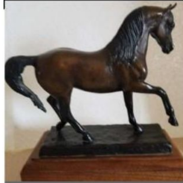
LEGION OF MERIT

Divisions 12 – 15 DO NOT count towards Legion of Merit or Supreme Legion of Merit Awards