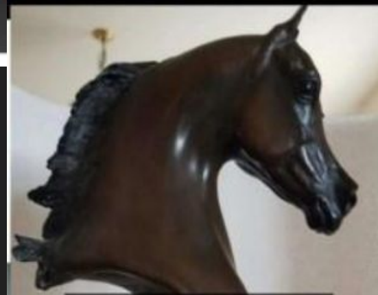
SUPREME LEGION OF MERIT