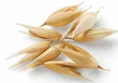
Oats Avena sativa