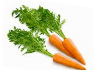
Carrot Daucus carota sativus