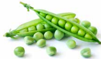
Pea Vine Pisum sativum