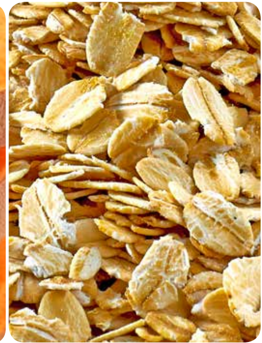
Four key ingredients grown on the Standard Process 420-acre certified organic farm: alfalfa, pea vine, sweet potato and oats