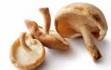
Shiitake Mushroom Lentinula edodes