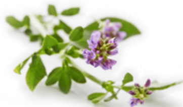
Alfalfa Medicago sativa