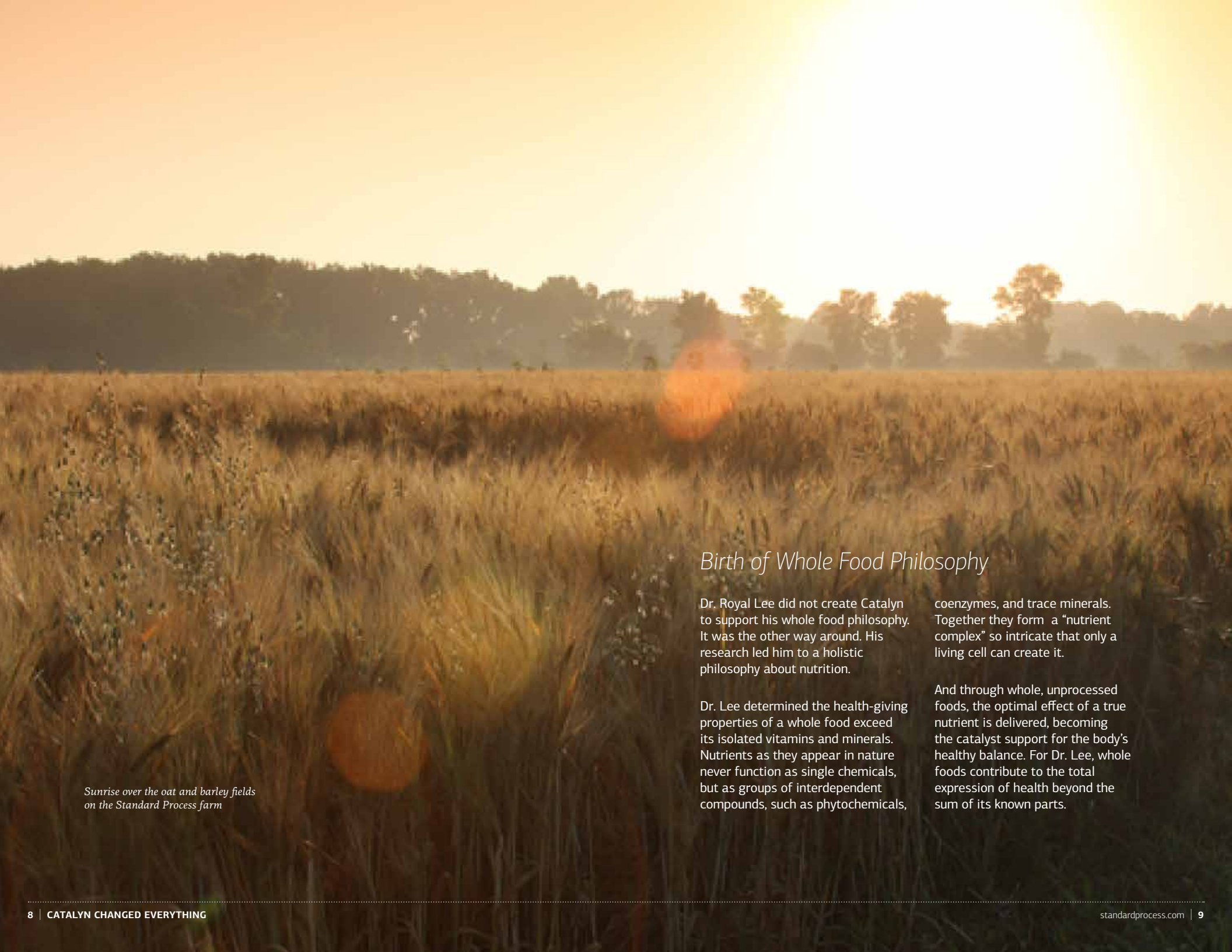
Sunrise over the oat and barley fields on the Standard Process farm