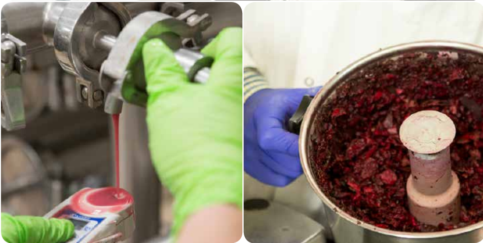
Our lab technician analyzing ingredients; checking the beet juice; fresh beets prior to juicing