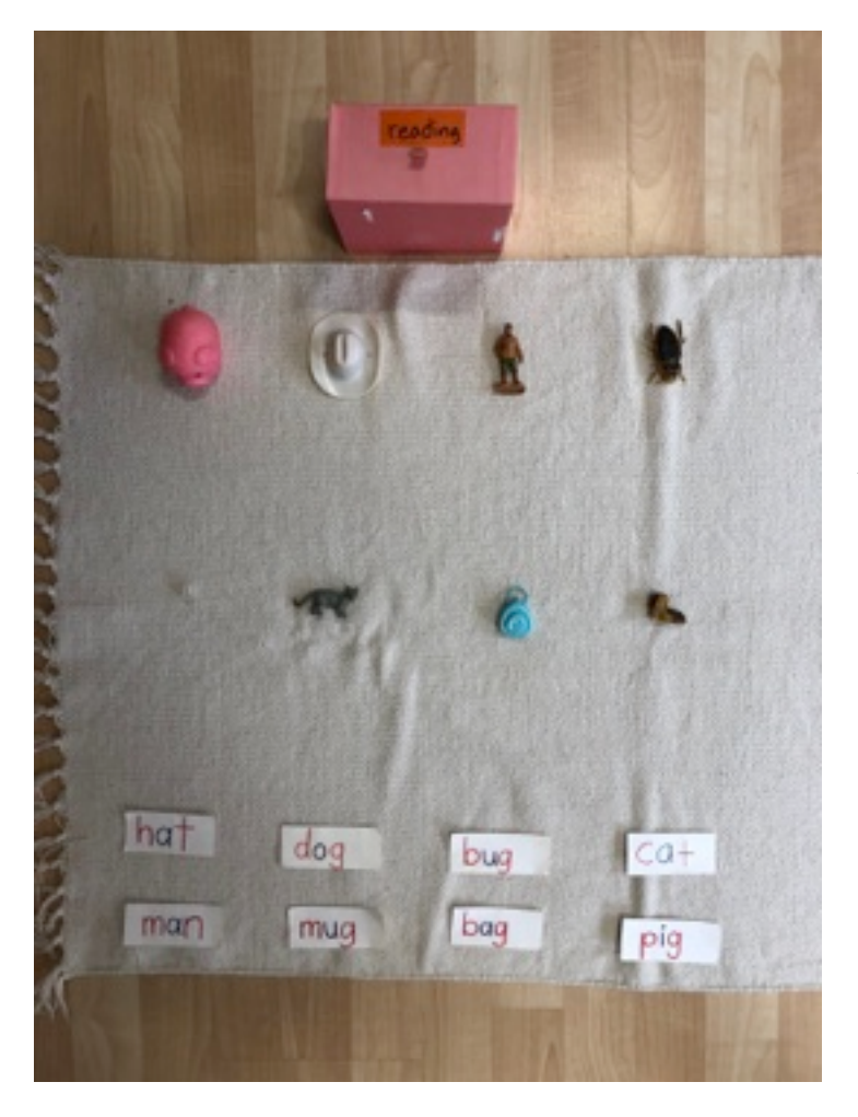
Yay! You're ready to start the Short Vowel Boxes!

The final box in the Pre-selected group is a reading box. The students place the objects or pictures on the mat, read the words out loud, and match the word cards to the corresponding objects or pictures.