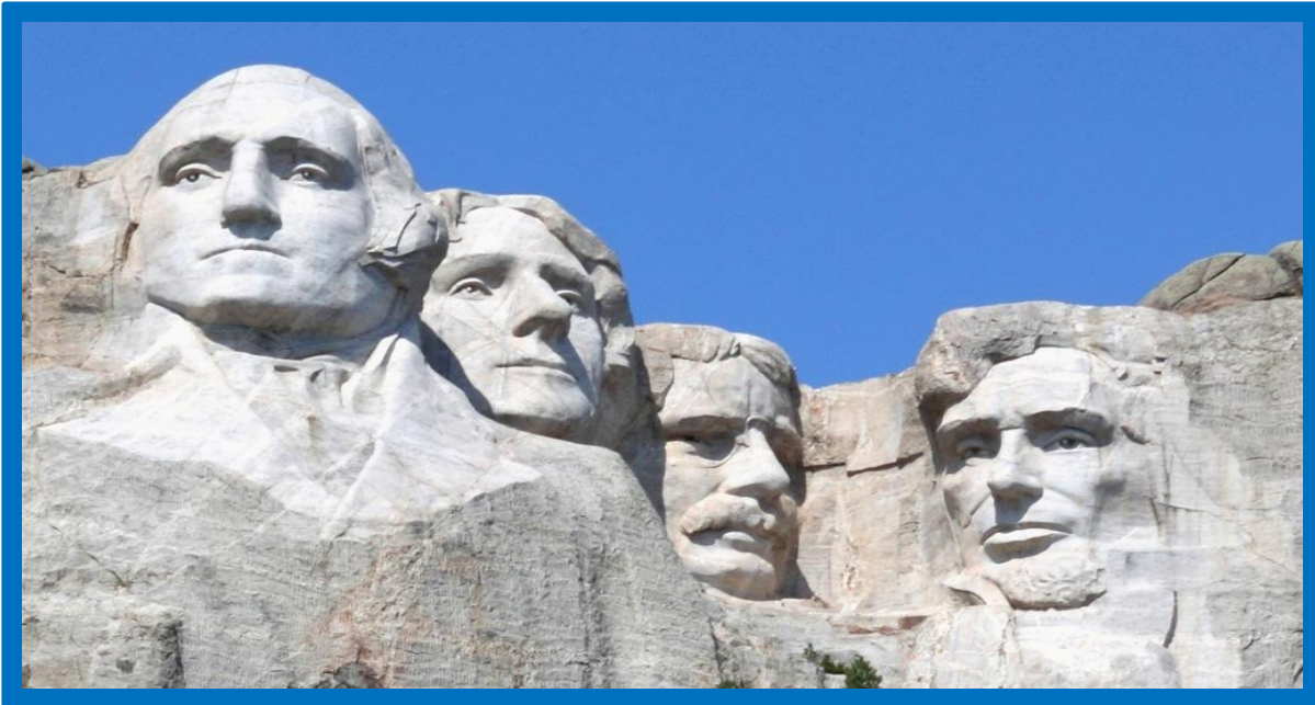
Mount Rushmore standing 5,725 ft (1,745 m) above sea level with the faces of four American Presidents, George Washington, Thomas Jefferson, Theodore Roosevelt, and Abraham Lincoln.