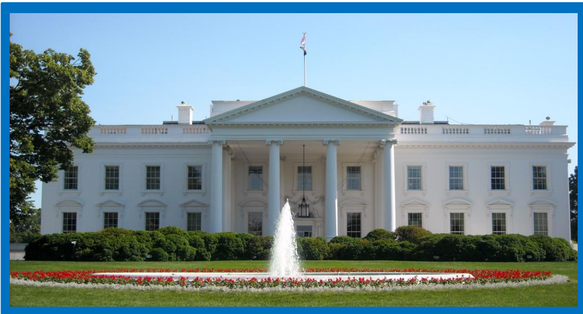
There are 132 rooms, 32 bathrooms, and 6 levels to accommodate all the people who live in, work in, and visit the White House. There are also 412 doors, 147 windows, 28 fireplaces, 7 staircases, and 3 elevators.