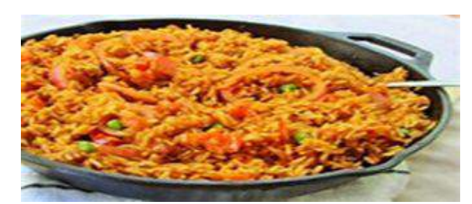
Jollof Rice + vegetables with chicken, yogurt, fruit & African pastries