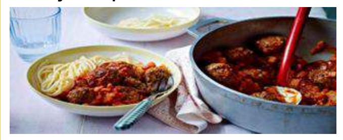
Spaghetti and Meatballs or Turkey sauce + Salad, yogurt & fruit