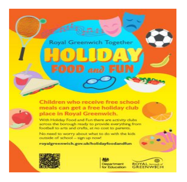
Ages: 4 - 16 years

Winter fun programme for children and young people. Come and have fun and make new friends while learning new things. Our four-day programmes include dancing, cinema, debate, multi-sports, hair braiding, jewellery, healthy eating, and arts and crafts. Breakfast and lunch are provided.