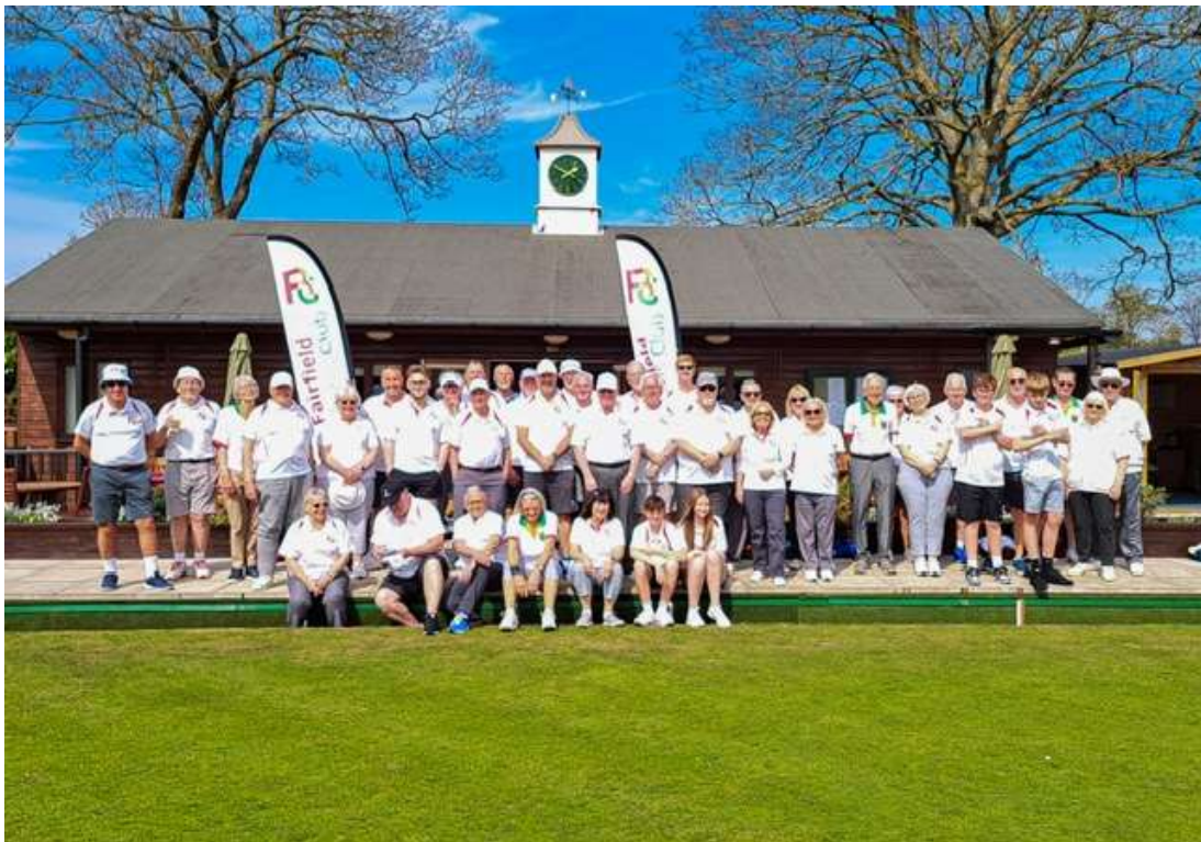
Traditional Opening of the Green – Captain v Chairman 12 th April 2025

At this time of year friendly, league, county, national and internal competitions come thick and fast. Once again we have increased our participation in county and national competitions so we wish all our participants good luck and prolonged involvement.