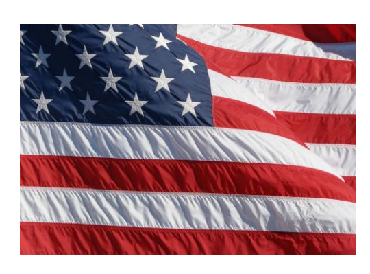
Check out Our Web Page! www.elburnpost630.org