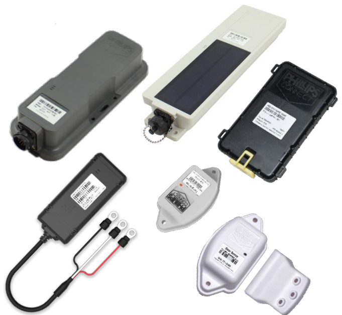
A full line of devices and form factors, plus add-on Bluetooth sensors for temp, ingress, load volume and trailer status.

Featuring fast, easy installation and IP67 rated harnesses and device, you can count on all your fleet assets reporting in consistently. No gaps. No hassles. The same reliability and ease of use that EROAD is known for in the truck is now available for all your trailers and assets.