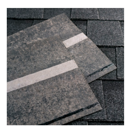
Titan XT™ shingles feature a reinforcing strip of polyester fabric on the back of the shingle to provide added anchoring for the expanded nailing zone.

Introducing an industry first — a high wind warranty with coverage up to 160 MPH , with only four nails installed in the expanded nailing zone, when using TAMKO® Starter.† Inspired by the combined performance of our AnchorLock<sup>TM</sup> layer and Advanced Fusion<sup>TM</sup> sealants to help the shingle hold fast.