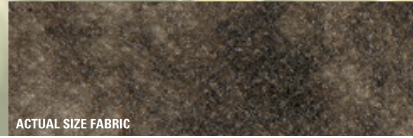
ACTUAL SIZE FABRIC