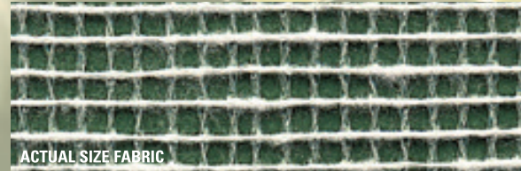
ACTUAL SIZE FABRIC