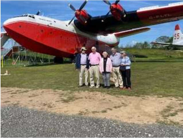
Visit to the Aviation Museum