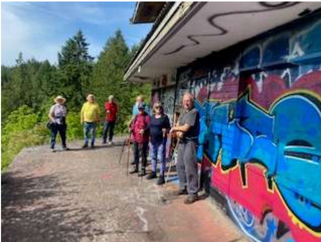
The hiking group at Stone Haven