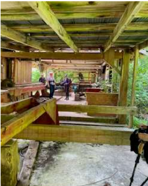
Hikers exploring an old saw mill