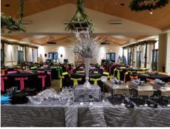
Social & Fund Raisers