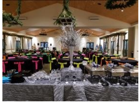
Langtree Event Venue