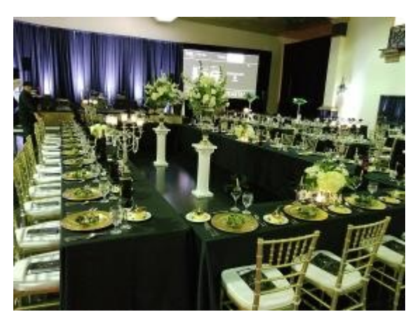
Fund Raisers Desserts Venues