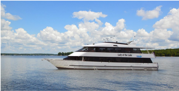
"Lady of the Lake"