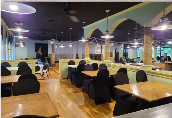
Main, Bar & Sunroom , Dance Floor & Stage(200 Guests)