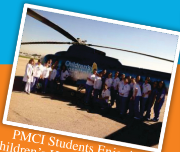
PMCI Students Enjoying Children's Hospital Los Angeles