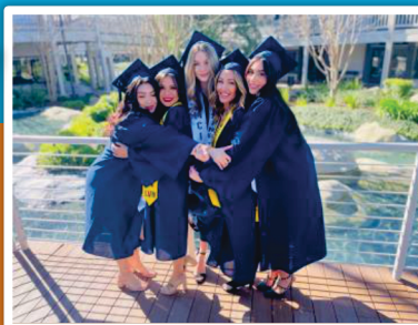
PMCI Fun Graduate Photos