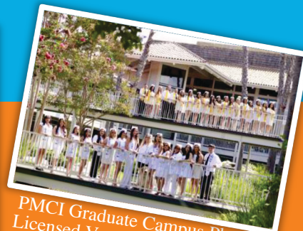
PMCI Graduate Campus Photos Licensed Vocational Nurse Class